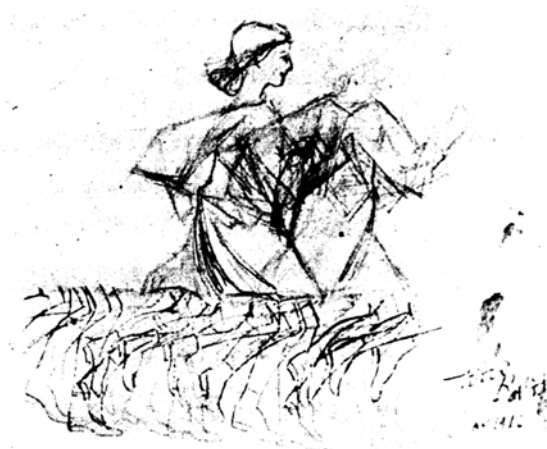
Giacomo Balla. Study for Girl Running on a Balcony , 1912. Collection Balla, Rome.