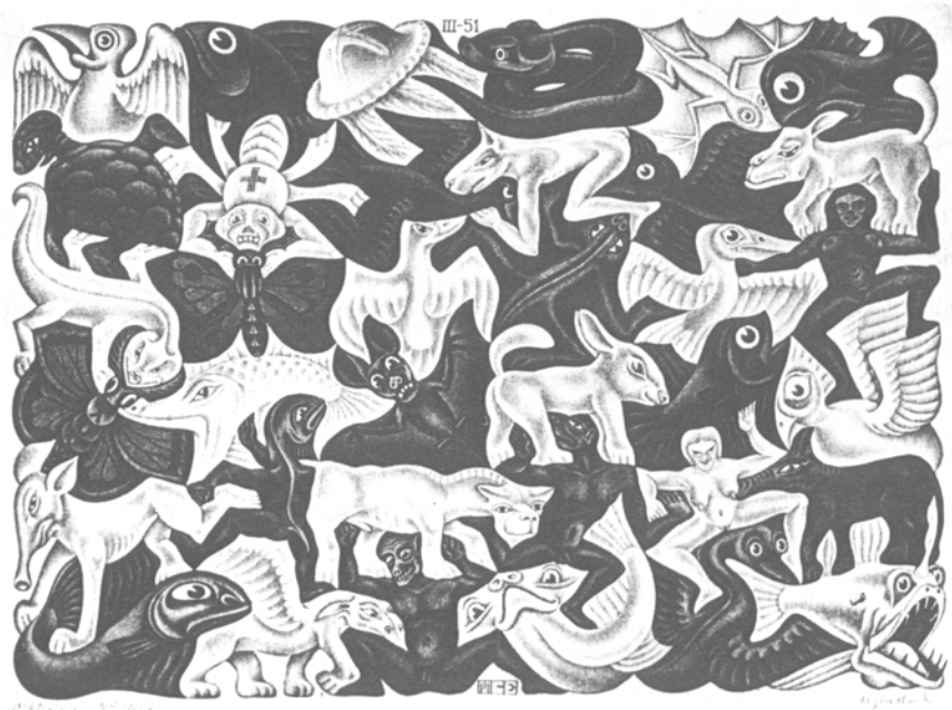
Fig. 1 – M. Echer