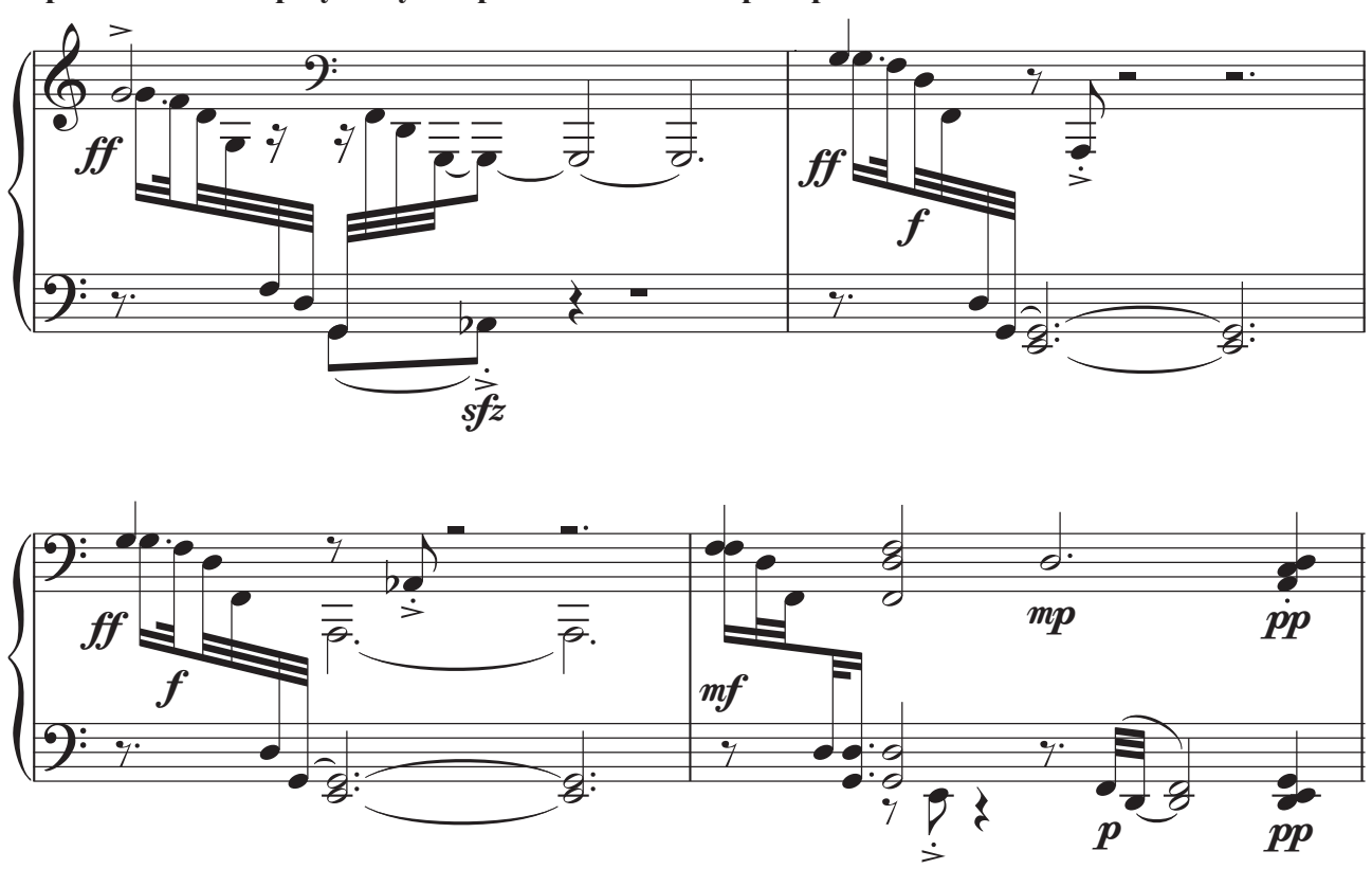
Excerpt 1. The music played by the piano in this excerpt is printed below.