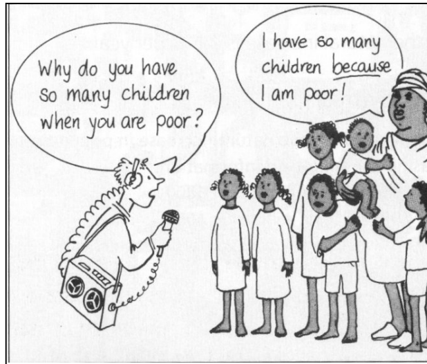
Many Parents in poorer countries have large families

There are many factors that affect population growth in poorer countries. Among these are: