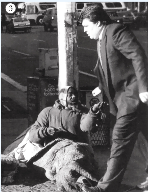
The Beggar and the Businessman