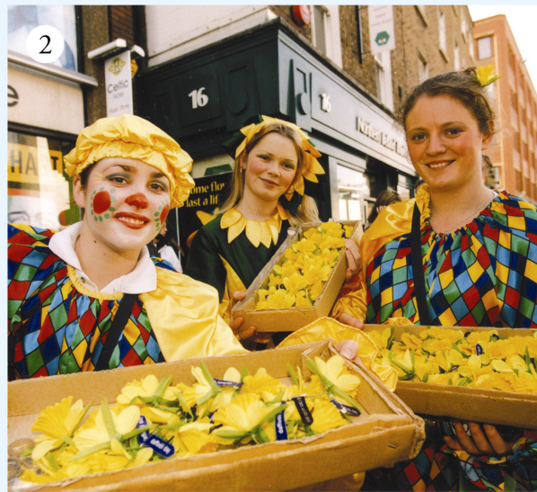
The Charity Collectors – Daffodil Day