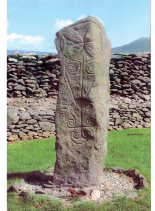
Cloch an Réisc Reask Pillar