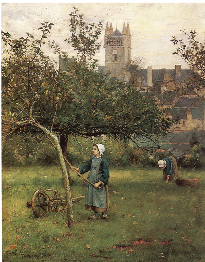
Bailiú Úll, Quimperlé le Walter Osborne Apple Gathering, Quimperlé by Walter Osborne