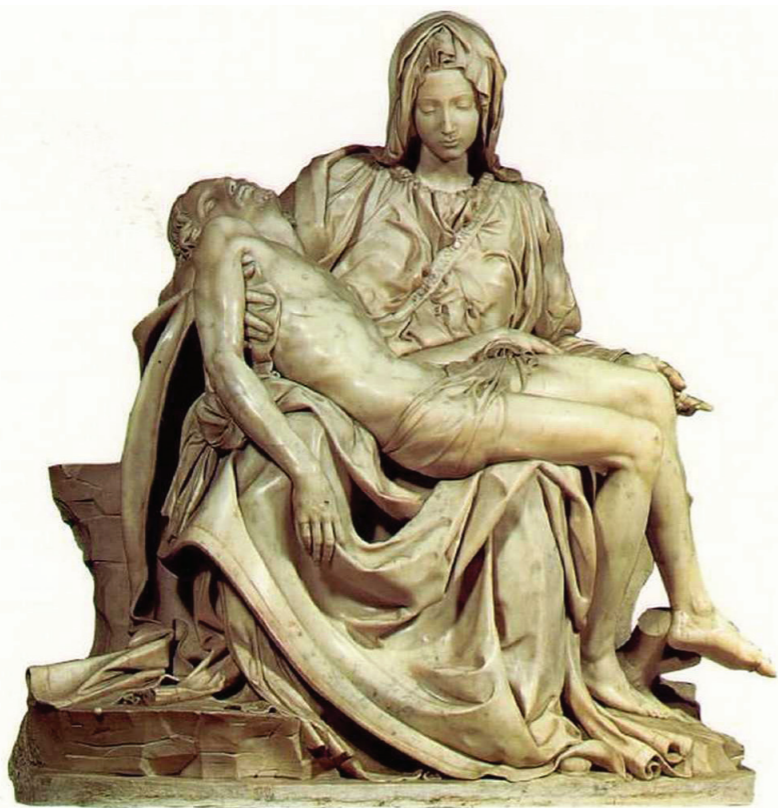
An Pietà le Michelangelo The Pietà by Michelangelo