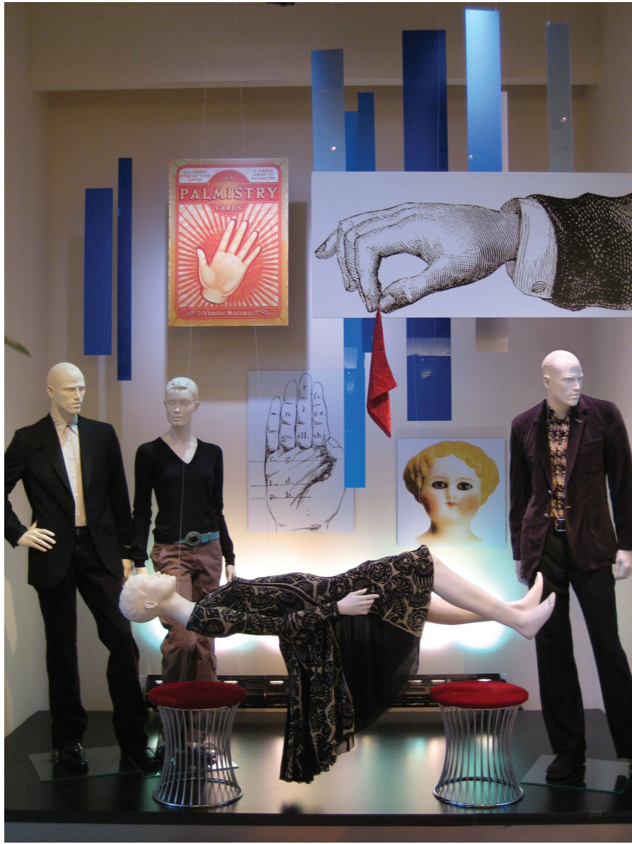
Taispeántas fuinneoige i siopa éadaí Clothing shop window display