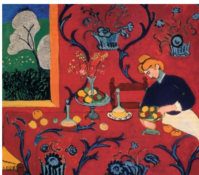
Harmony in Red by Matisse Dathanna i gComhréir lena Chéile i nDearg le Matisse