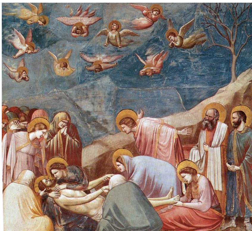
The Deposition of Christ by Giotto Leagadh Anuas Christ le Giotto