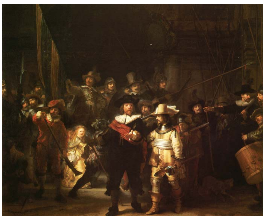
The Night Watch by Rembrandt An Faire Oíche le Rembrandt