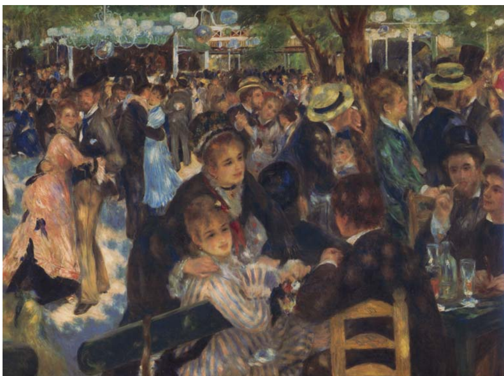
Le Bal ou Moulin de la Galette by Renoir Le Bal ou Moulin de la Galette le Renoir