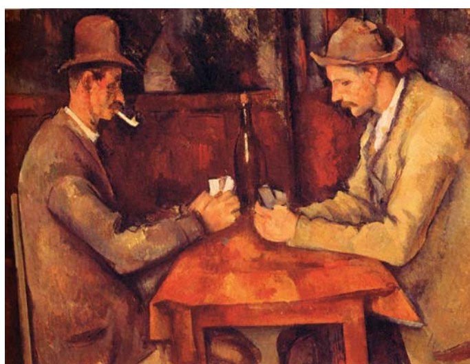
The Card Players by Cezanne Na hImreoirí Cáirtaí le Cezanne