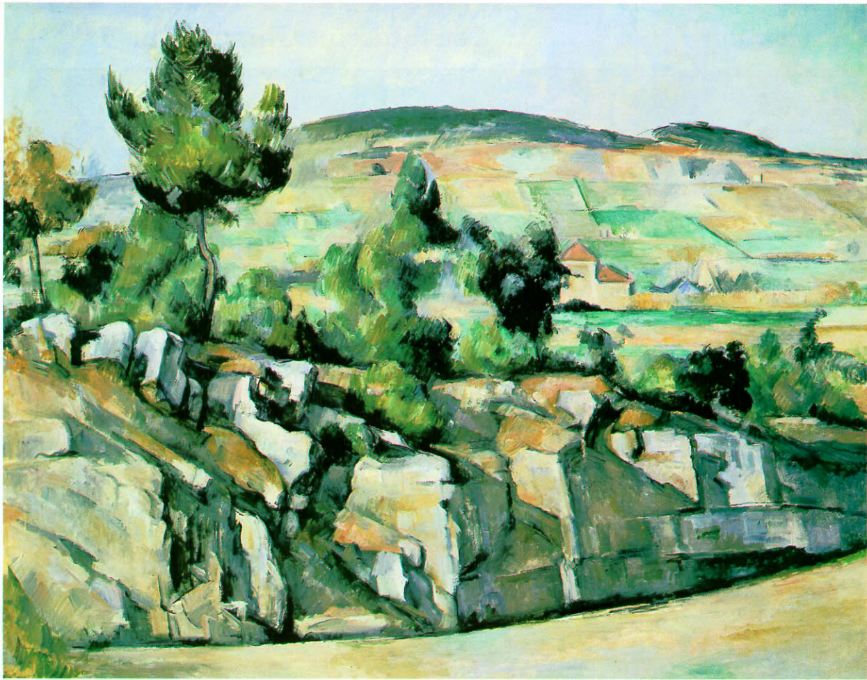
The National Gallery, London Gaileri Náisiúnta, Londain