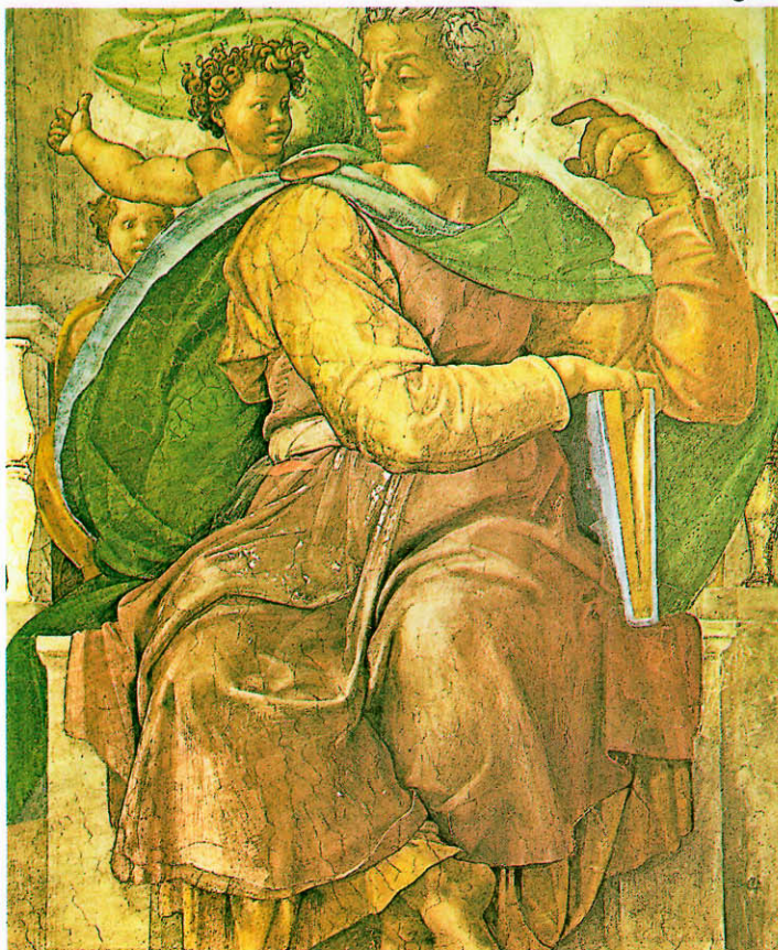
The Chair of the Prophet Isaiah Cathaoir Isiah Faidh MICHELANGELO