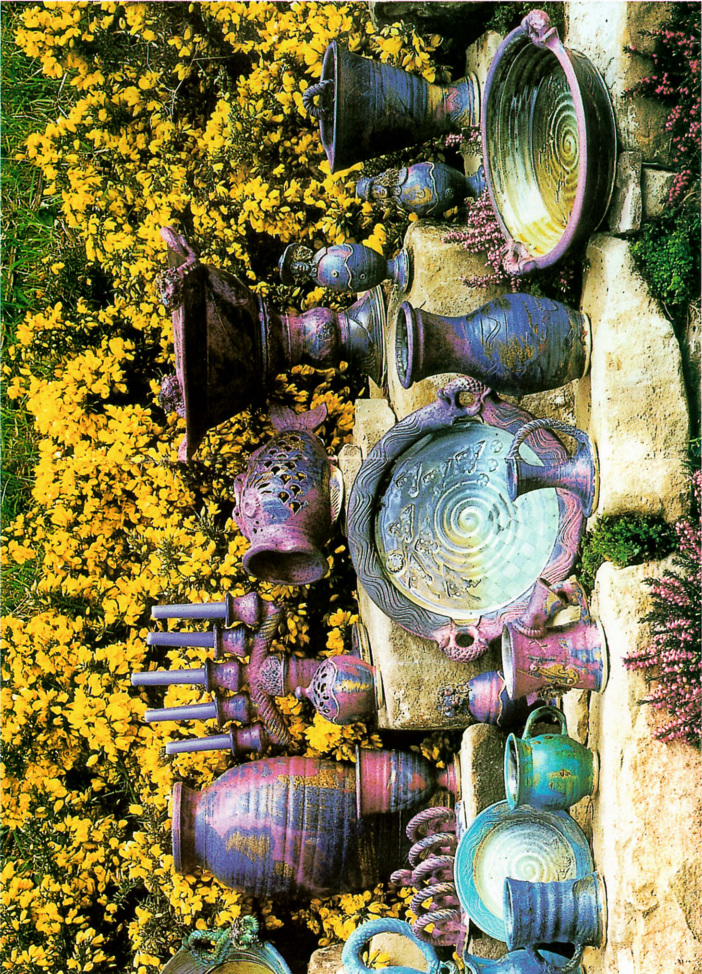
Ceramics Criadóireacht MICHEAL KENNEDY