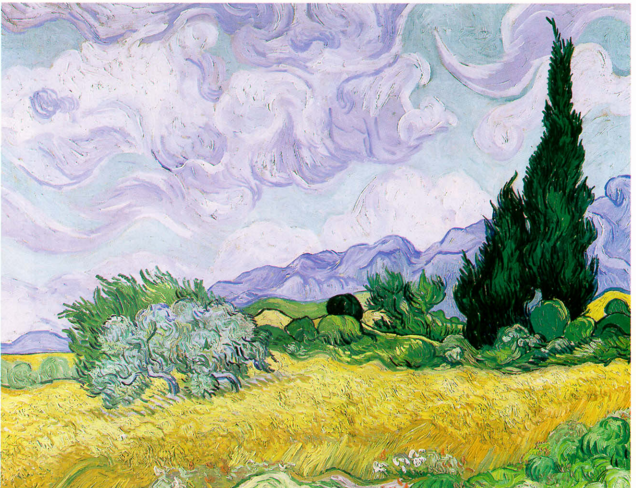
The National Gallery, London Gaileri Náisiúnta, Londain