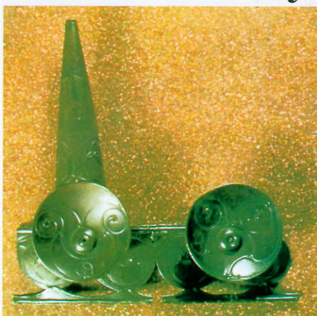
The Petrie Crown Coróin Petrie National Museum of Ireland Músaem Náisiúnta na hÉireann