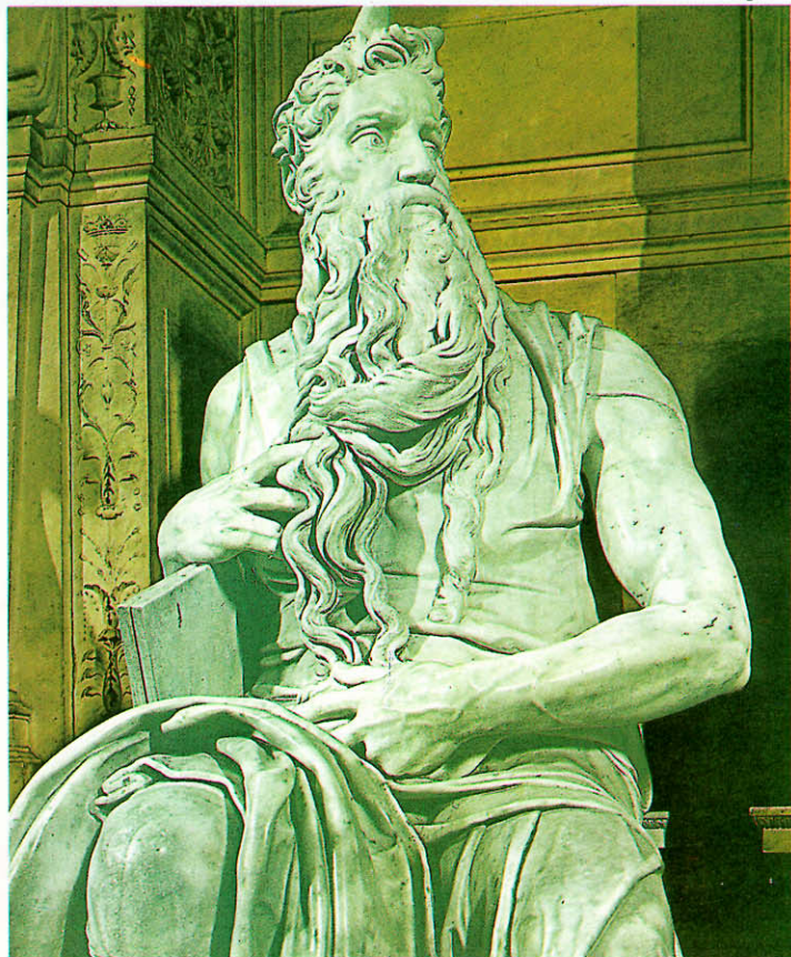
The Statue of Moses Dealbh Maoise MICHELANGELO