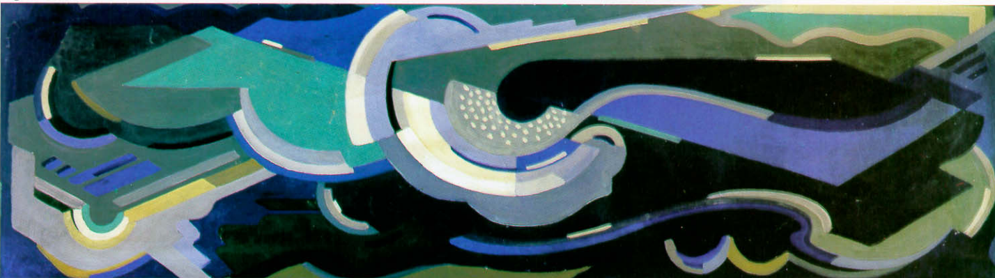
A Composition-Sea Rhythm, National Gallery of Ireland Ceapadoireacht-Rithim na Farraige, Dánlann Náisiúnta na hÉireann