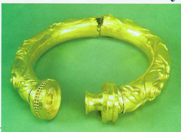
The Brighter Collar Bóna nó Cóiléir Brú Íochtair National Museum of Ireland Músaem Náisiúnta na hÉireann