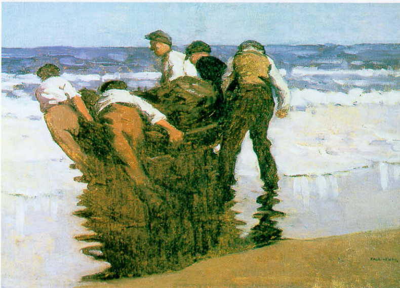
Launching the Currach, National Gallery of Ireland Ag Chur an Churraigh Chun Farraige, Dánlann Náisiúnta na hÉireann PAUL HENRY