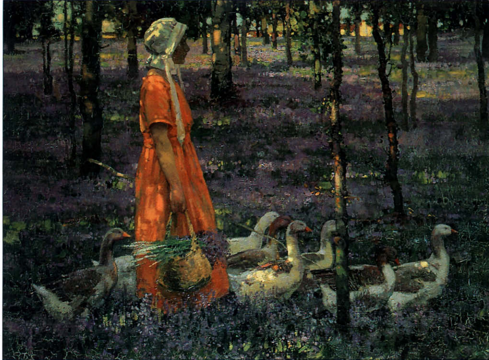
The Goose Girl (The National Gallery of Ireland)