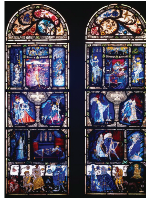
Fuinneog Naomh Úna le Harry Clarke The Eve of Saint Agnes by Harry Clarke