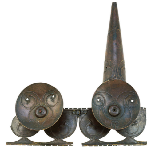
Coróin Petrie Petrie Crown