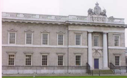
The Custom House, Dublin by James Gandon Teach an Chustaim, Baile Atha Cliath le James Gandon