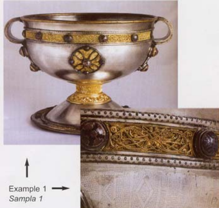
Example 1 Sampla 1