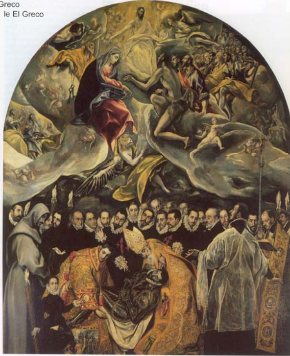
Burial of Count Orgaz by El Greco Adhlacadh an Chunta Orgaz le El Greco