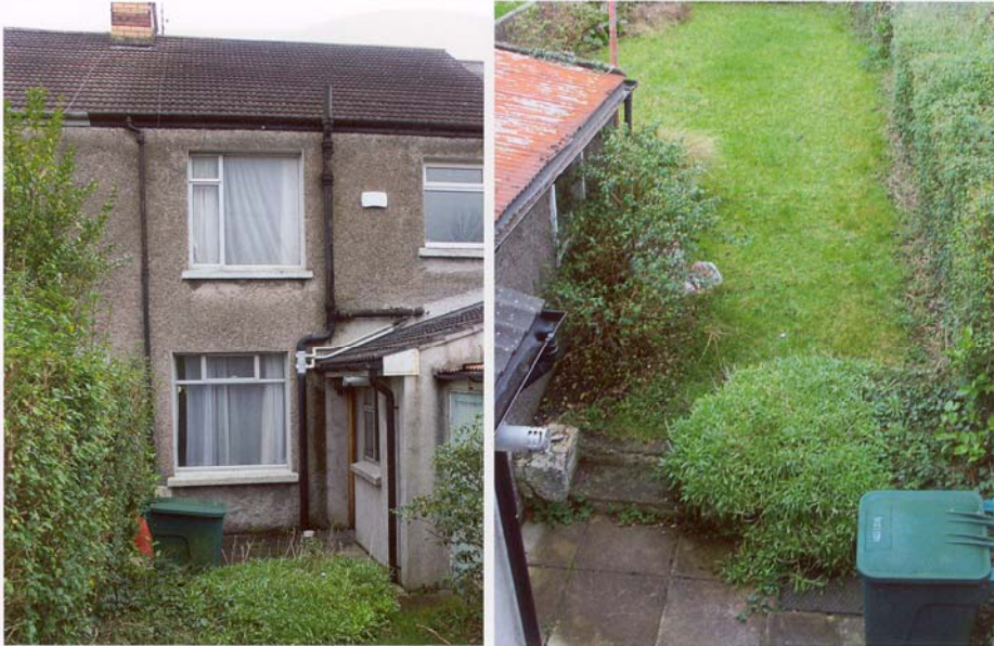
↑ Outdoor room Seomra amuigh ↑