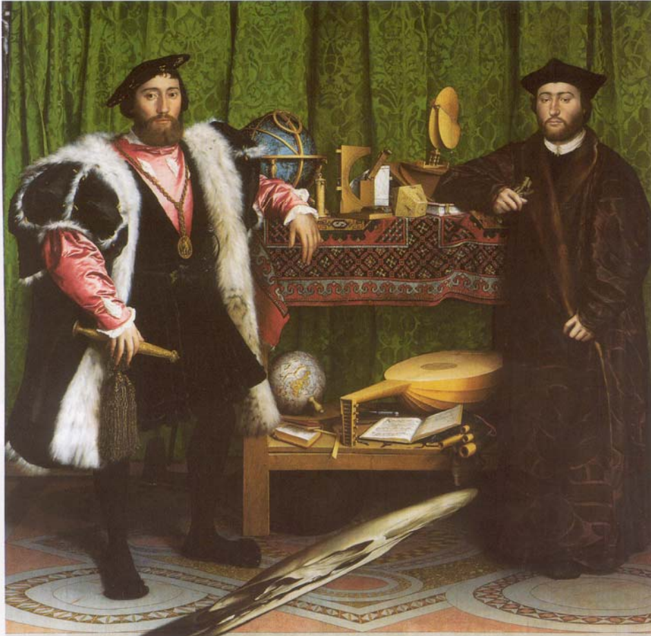
The Ambassadors by Hans Holbein Na hAmbasadóirí le Hans Holbein