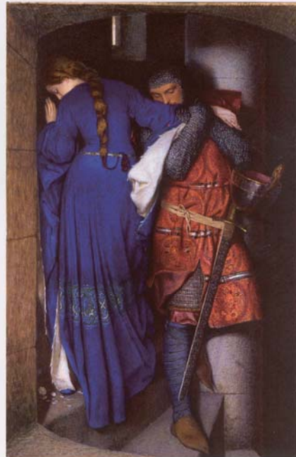
A Meeting on the Turret Steps by Frederic Burton Teagmháil ar Chéimeanna an Túirín le Frederic Burton