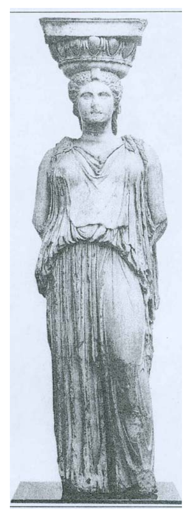
Photograph B: John Boardman, Greek Art, ill 142, p. 153 (Thames and Hudson 4th Edition Revised.)