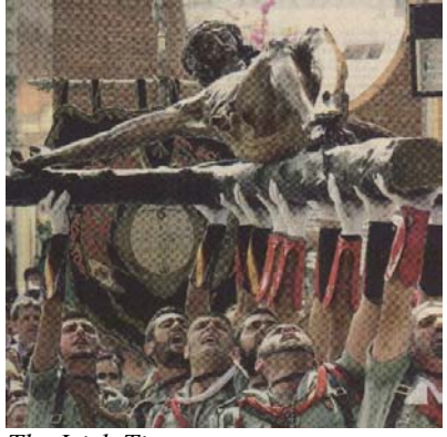
The Irish Times