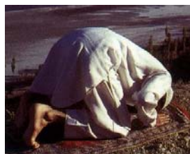
Prayer Mat Flame Tree Publishing