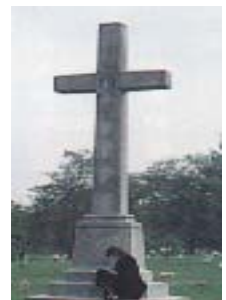
Cross Saint Mary's Press