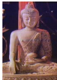
Statue of Buddha Articles of Faith