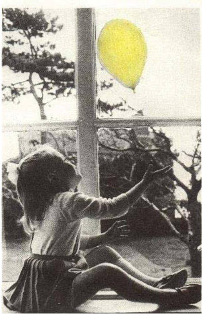
Veritas - Adapted

A. Pick one thing from the photograph which suggests that this is an experience of awe and wonder for the girl.