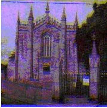
St. Peter and St. Paul's Church, Harold's Cross Road, Dublin