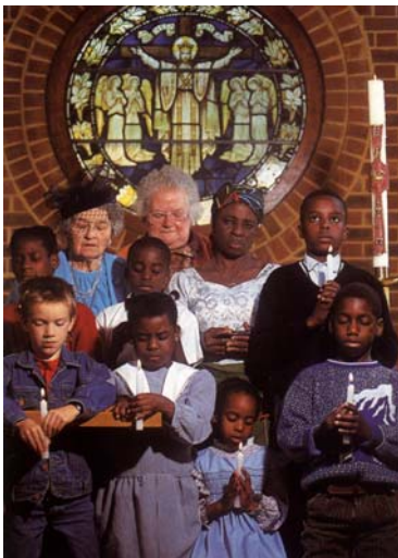
Flame Tree Publishing 2002

A. State one thing from the photograph which suggests that these people are expressing their religious faith.