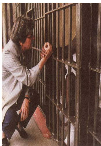
Saint Mary's Press

Question 2. This is a photograph of a religious sister comforting a death-row prisoner.