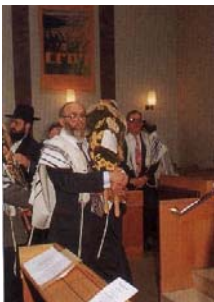
Scrolls of the Torah Transedition Ltd & Fernleigh Bks

B. Below are pictures of objects used in prayer and religious rituals.