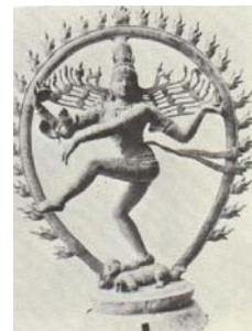
Statue of Shiva

a. Pick any two of these objects and explain why each is important in a world religion.