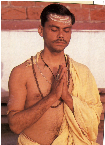
Transedition Limited and Fernleigh Books

A. Pick one thing from this photograph which suggests that this person is performing a religious ritual.