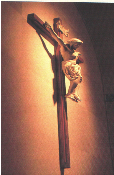
Saint Mary's Press

A. Pick one thing from this photograph which suggests that this is a religious symbol.