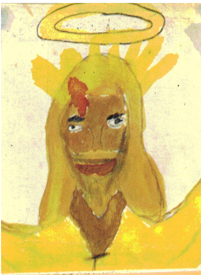
Garrod & Lofhouse Ltd.

Question 2. This is a picture of a child's image of God.