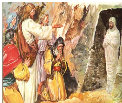
Adapted from Octopus Books Limited

Question 2. This drawing is based on the miracle of Jesus raising Lazarus from the dead.