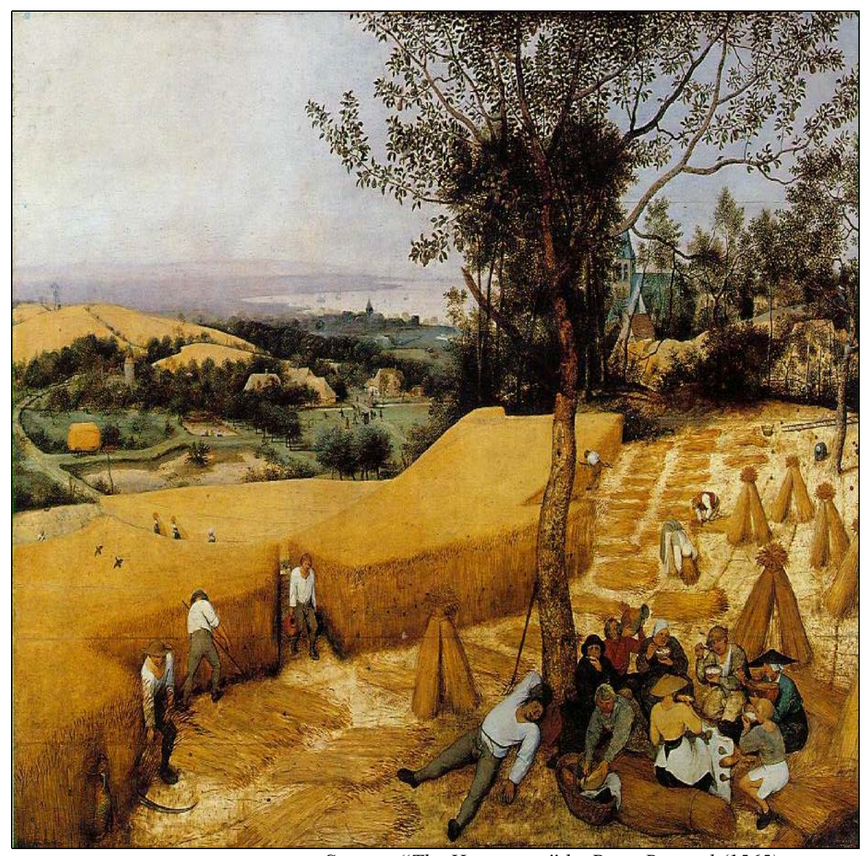
Source: "The Harvesters" by Peter Bruegel (1565) Metropolitan Museum of Art, New York.