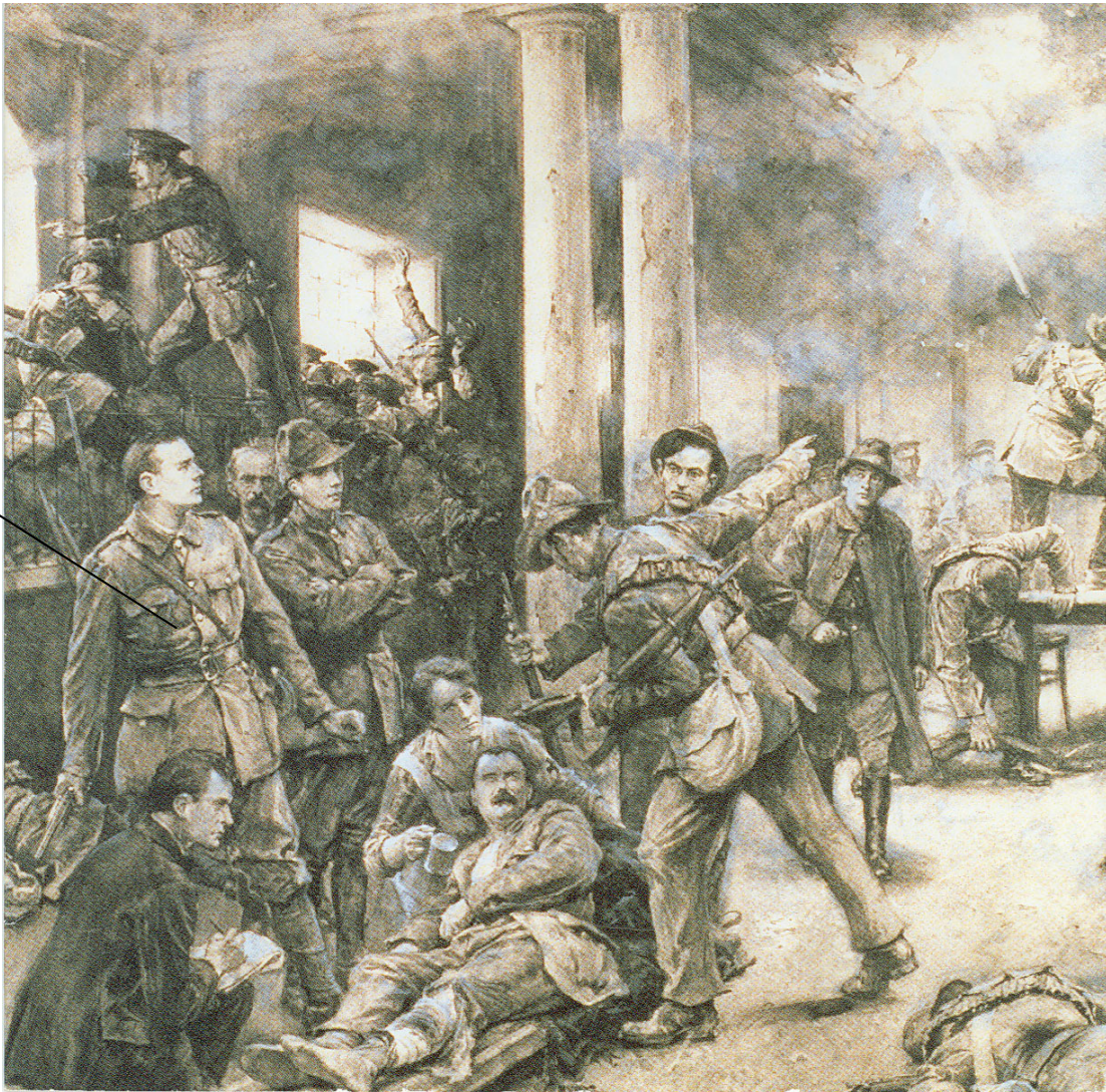
(Source : 'Birth of the Republic' by Walter Paget. National Museum of Ireland.)