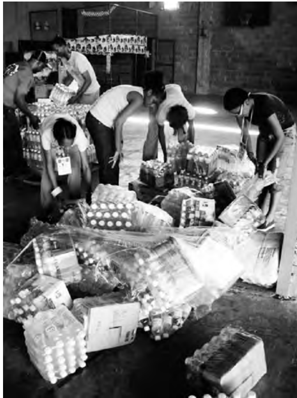
Christian volunteers helping to pack bottled water for earthquake victims.