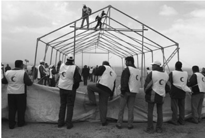
Muslim aid workers putting up a tent for preparing hot meals and storing relief items in a refugee camp in Jordan.