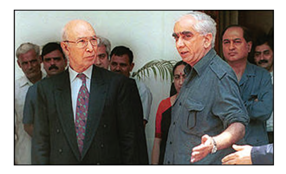
The Foreign Ministers of India and Pakistan during talks on Kashmir, June 1999

Explain why it is so difficult to resolve the Jammu and Kashmir conflict.