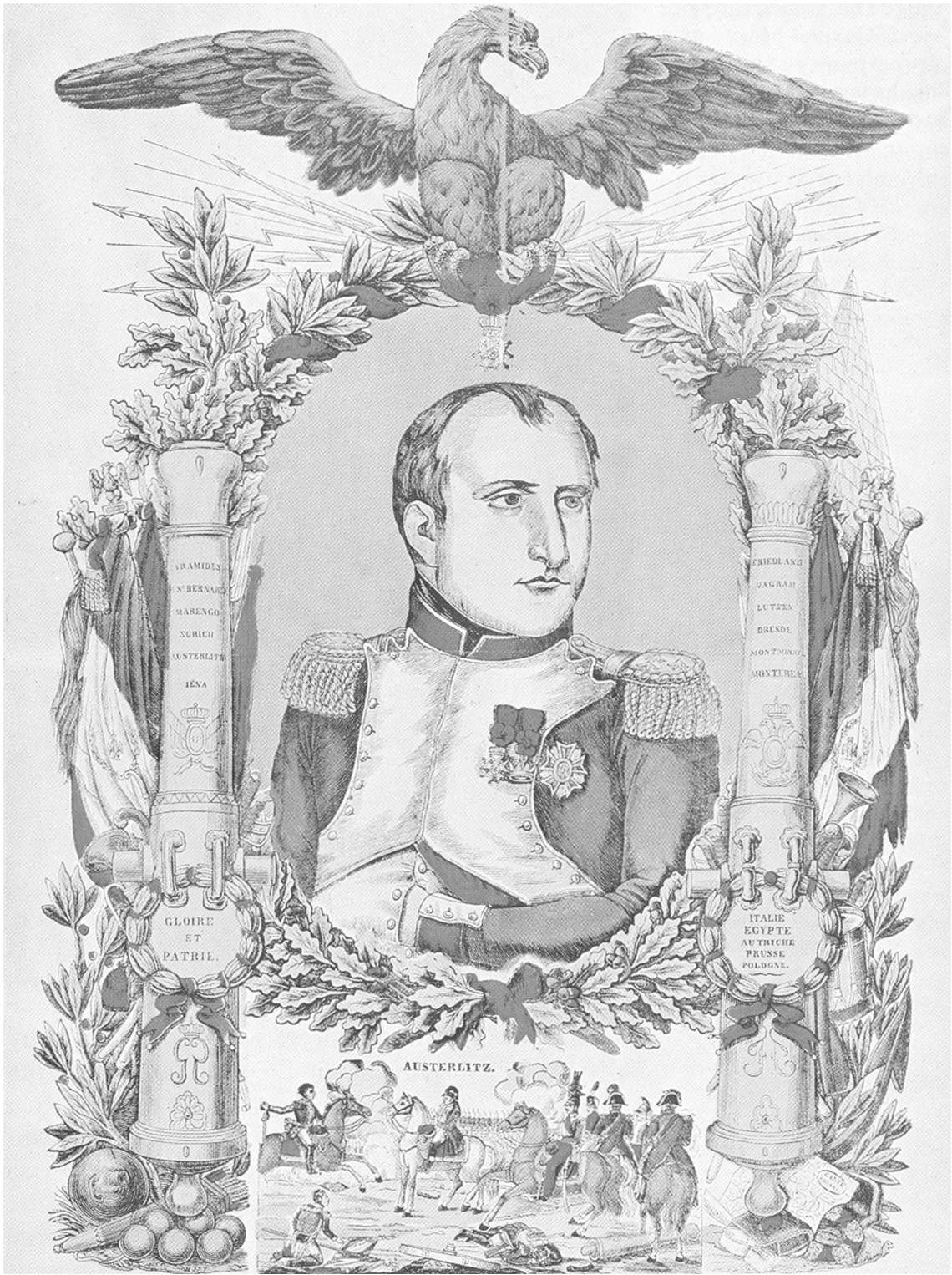
SOURCE C: A French poster to celebrate the French victory at Austerlitz, published soon after the battle.