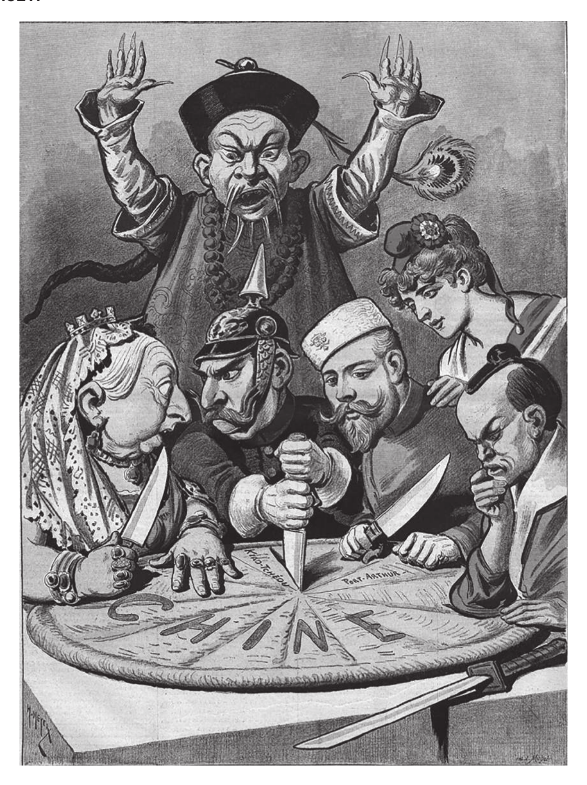
A cartoon published in a French magazine, 1898. The caption reads 'China – the cake of kings and of emperors'. The countries around the table are, from left to right, Britain, Germany, Russia, France and Japan.