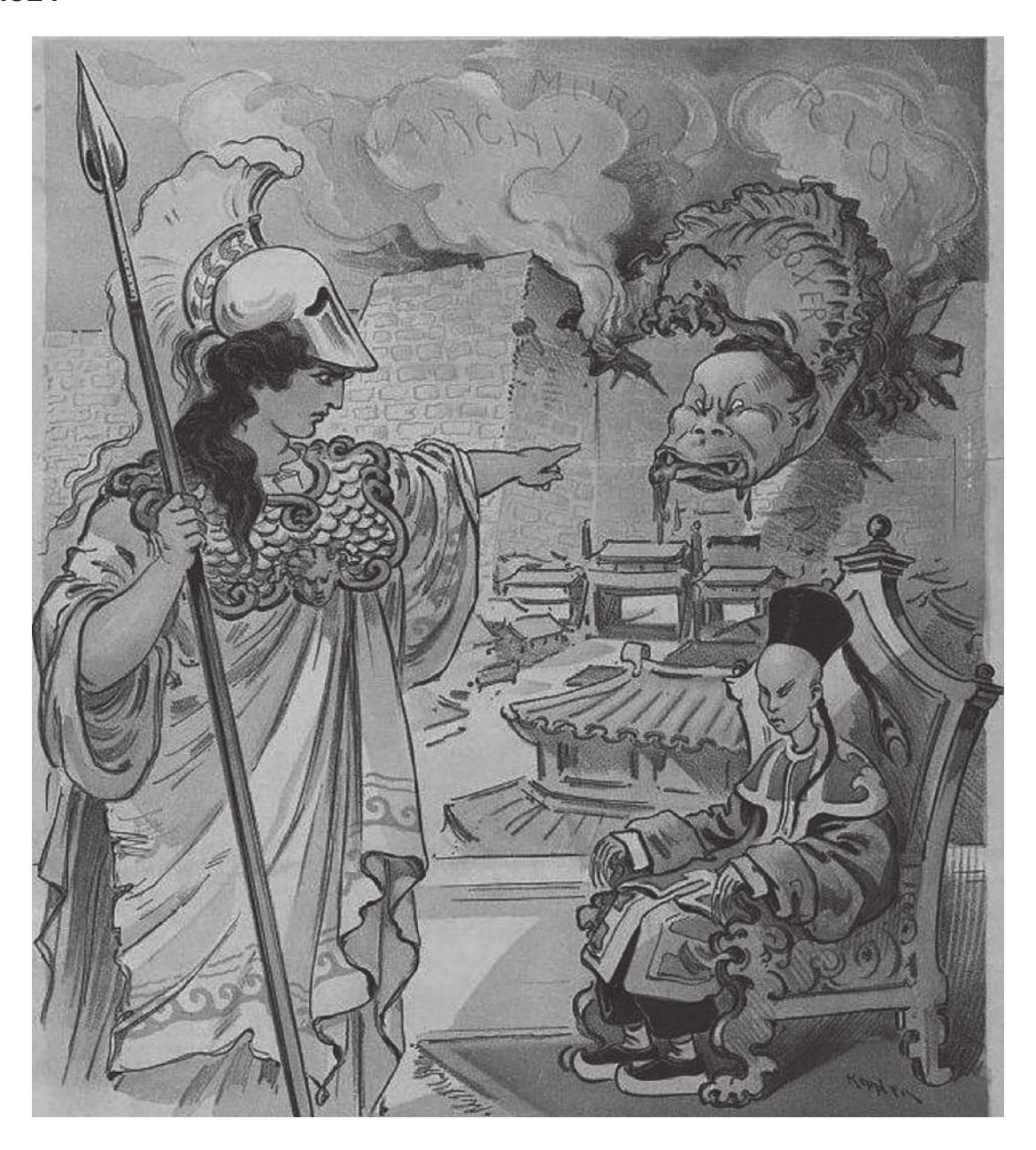
A cartoon published in an American magazine, August 1900. The caption reads 'The First Duty. Civilisation speaking to China: "That dragon must be killed before our relationship can be improved. If you don't do it, I shall have to."'