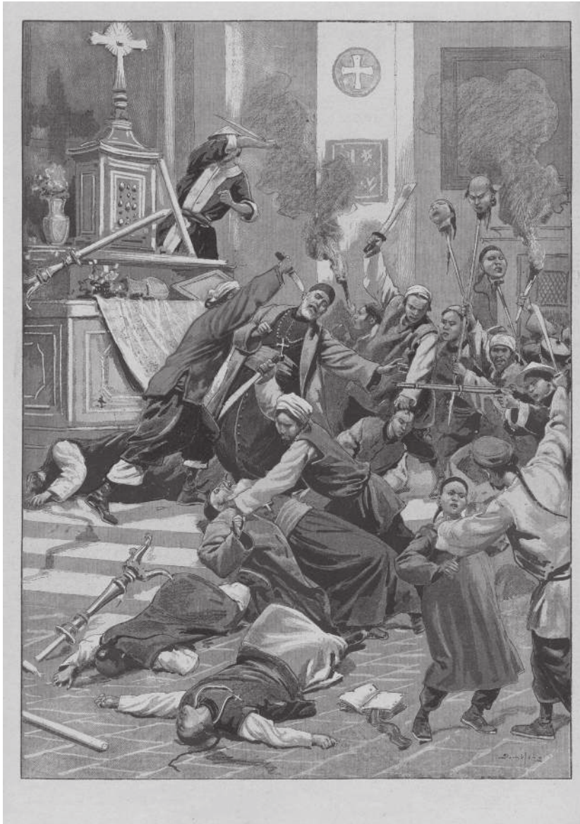
From a French newspaper, August 1900. It shows Boxer rebels in a Christian church.