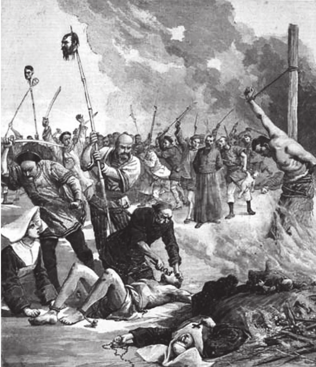
A European drawing from the time showing what happened to some Christians during the Boxer Rebellion.