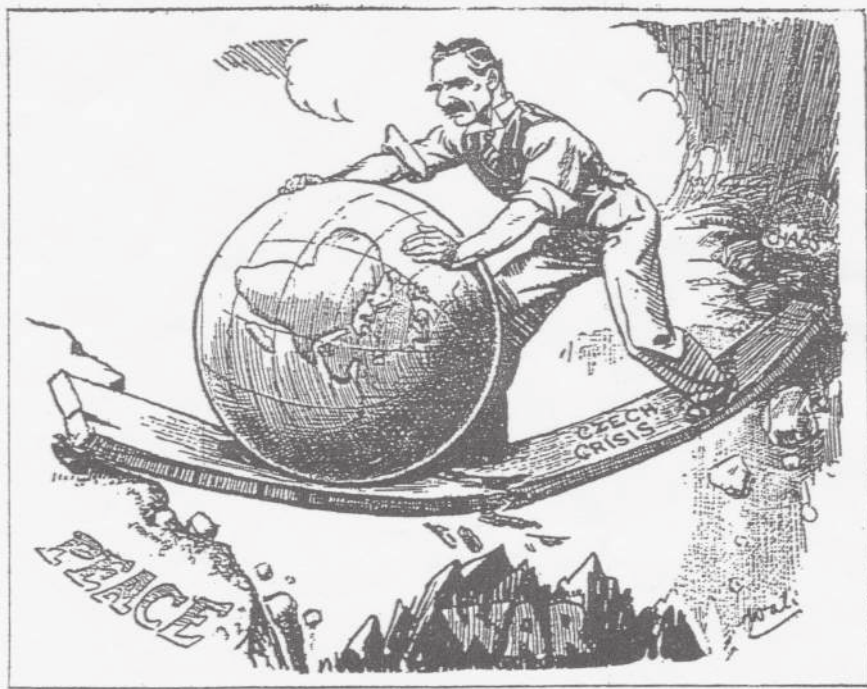
A British cartoon published on 25 September 1938.