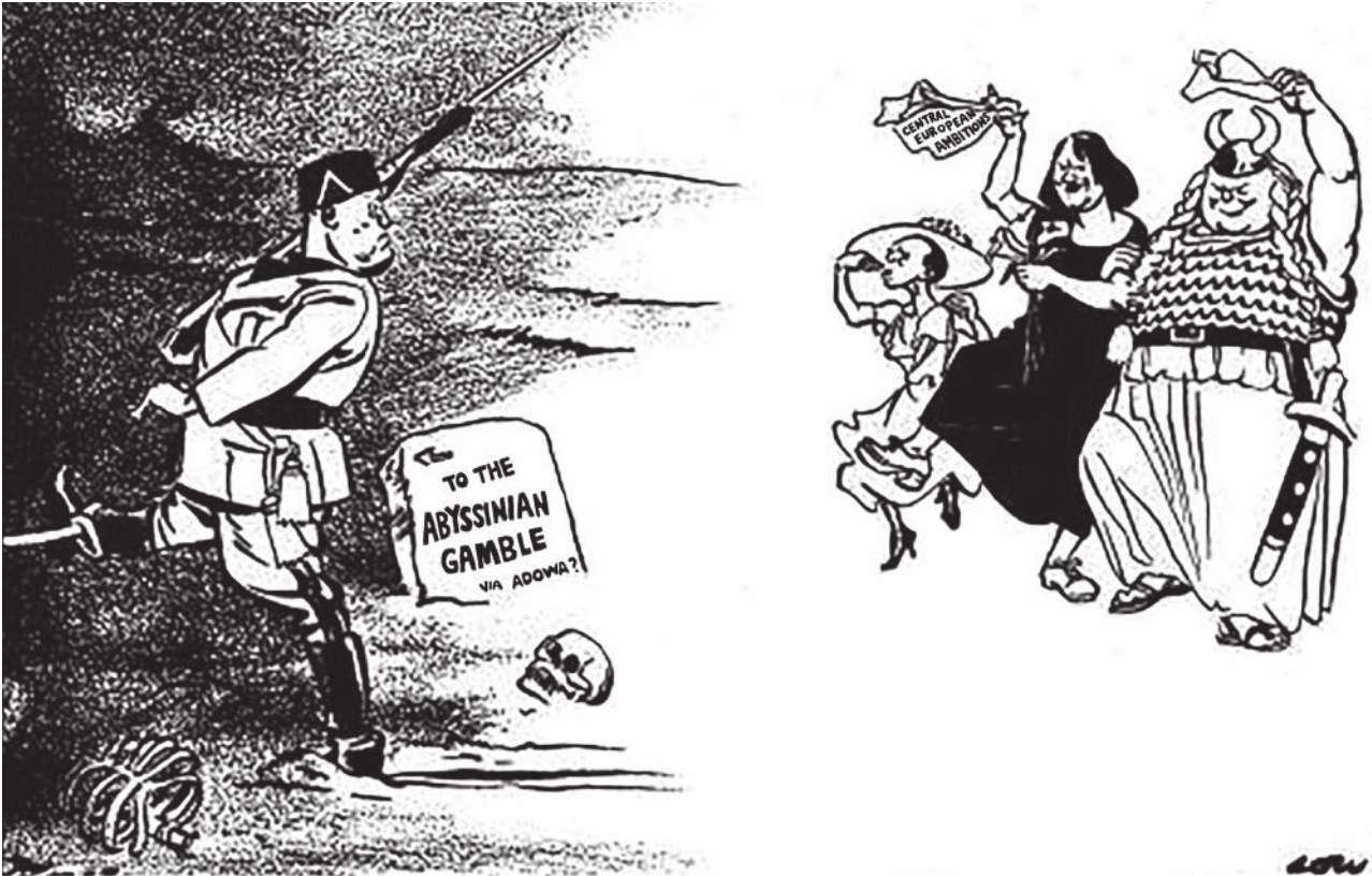
THE GIRLS HE LEFT BEHIND HIM

A British cartoon published in May 1935. The figures on the right are Goebbels, Hitler and Göring.