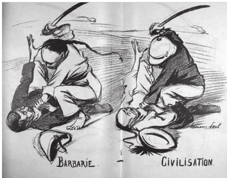
A cartoon about the Boxer Rebellion published in a French magazine, July 1899. 'Barbarie' means 'Barbarism'.