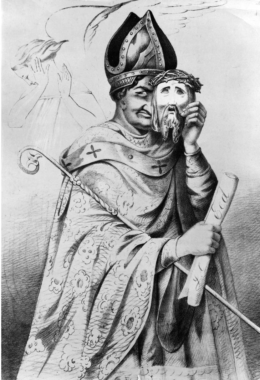
A cartoon of Pope Pius IX published in 1852. He is holding a mask of Christ.