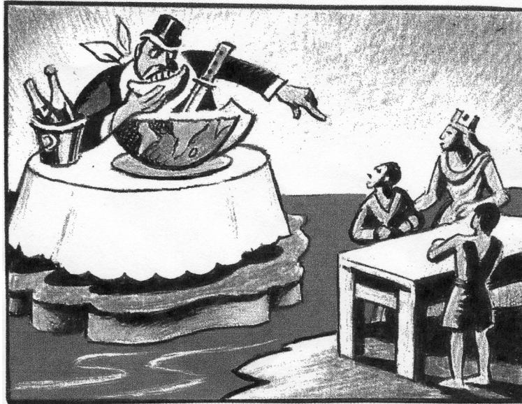
An Italian cartoon showing Britain (top left) criticising Italy (bottom right) over Abyssinia. This cartoon was published in October 1935 in a newspaper founded by Mussolini.