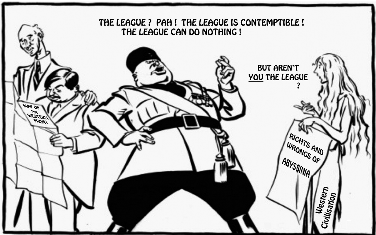
A British cartoon published in February 1935.