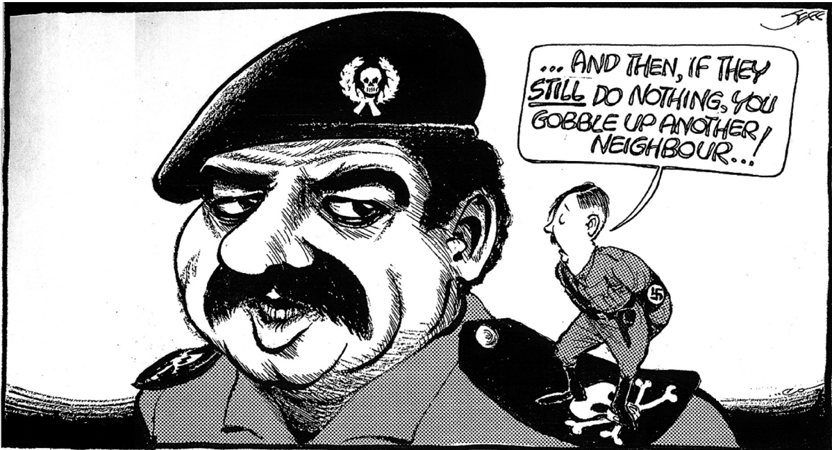
An Australian cartoon, published in August 1990. It shows Hitler on Saddam Hussein's shoulder.