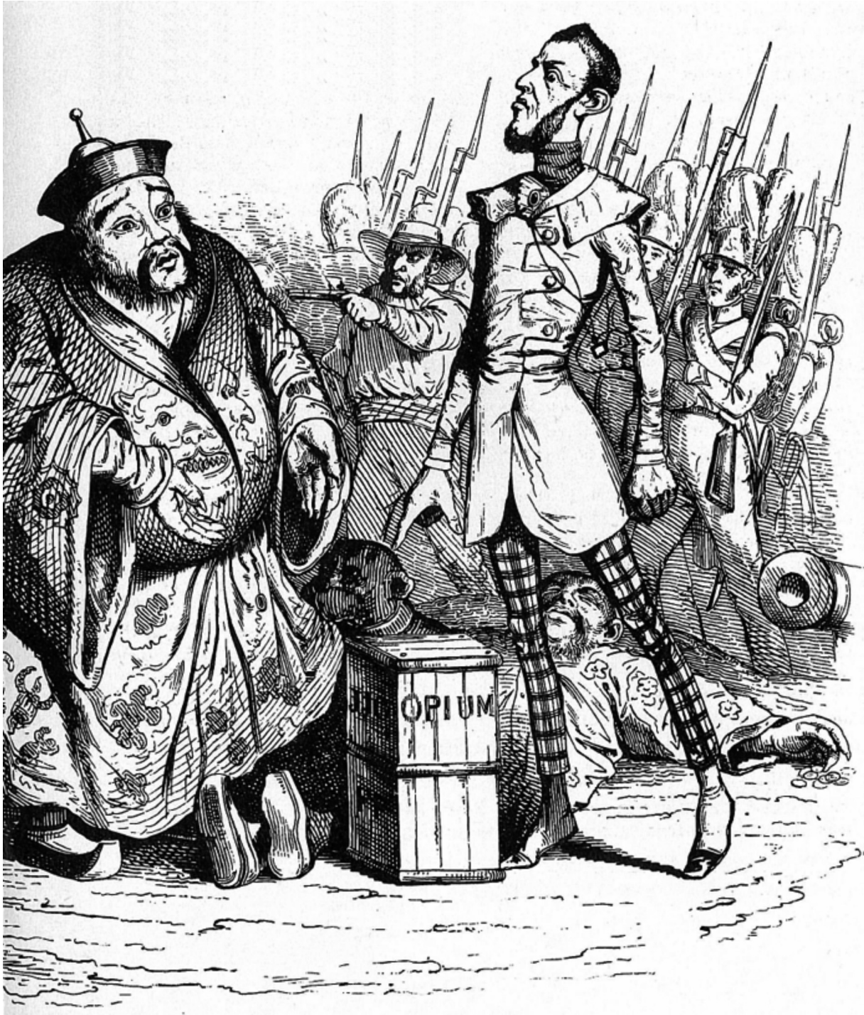
A German cartoon entitled 'English Trade', published in 1840. On the left is Lin Zexu.