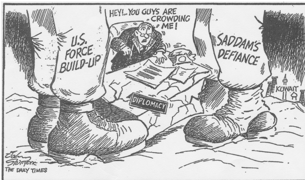
A US cartoon, published in the second half of 1990.