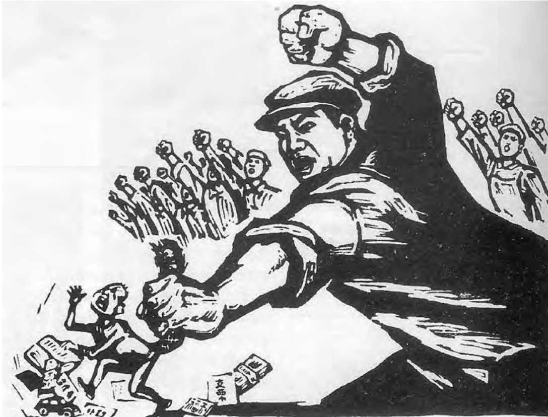
A poster published during the Cultural Revolution.

16 Look at the poster, and then answer the questions which follow.