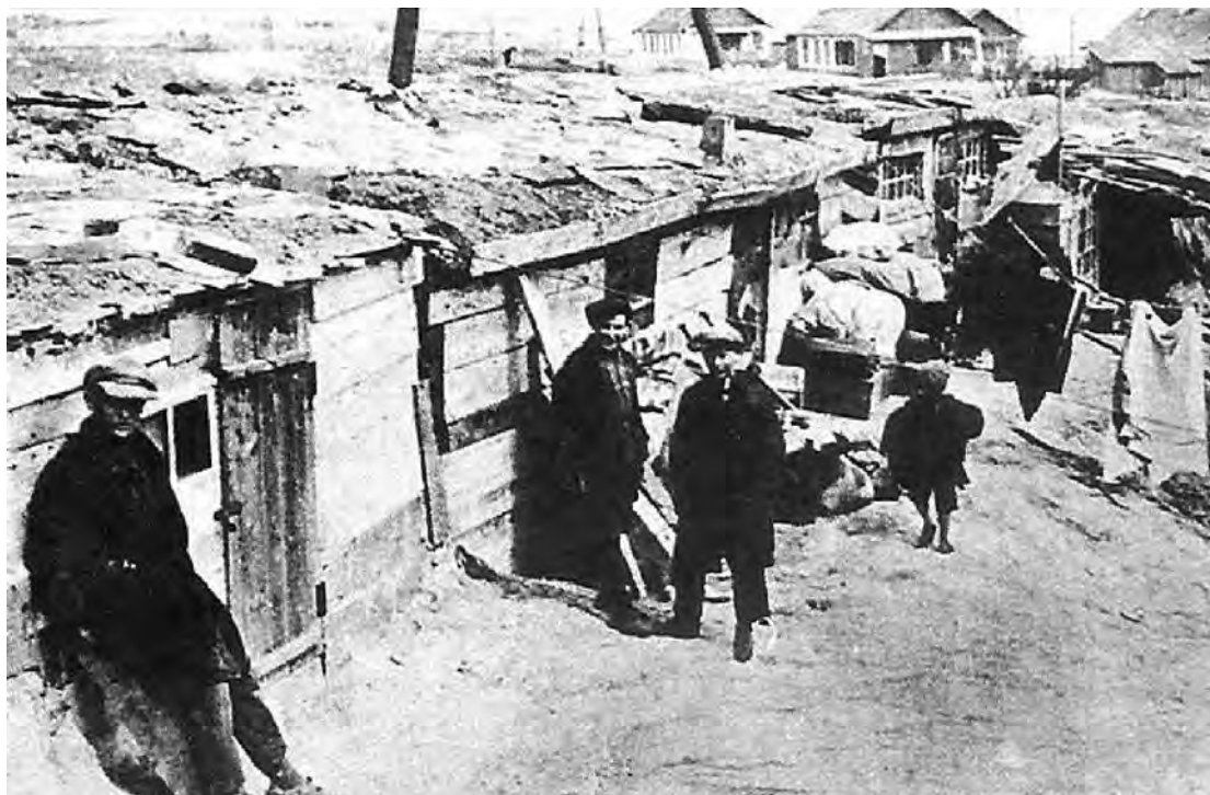
A photograph of workers' living accommodation at the Dnieper Dam site in 1931.

12 Look at the photograph, and then answer the questions which follow.