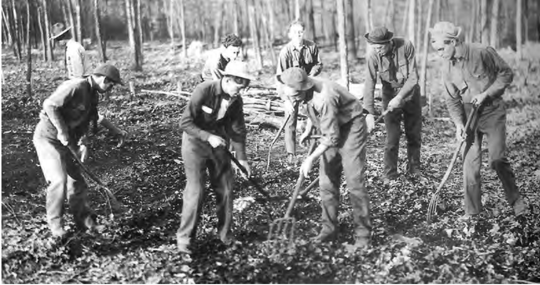
A photograph of young American men employed by the Civilian Conservation Corps (CCC) during the 1930s.

14 Look at the photograph, and then answer the questions which follow.