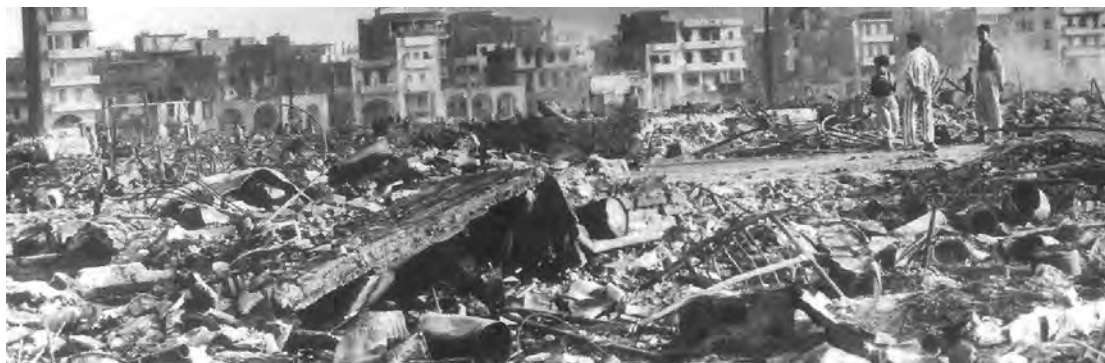
A photograph of Port Said, at the northern end of the Suez Canal, after British bombing, October 1956.

20 Look at the photograph, and then answer the questions which follow.