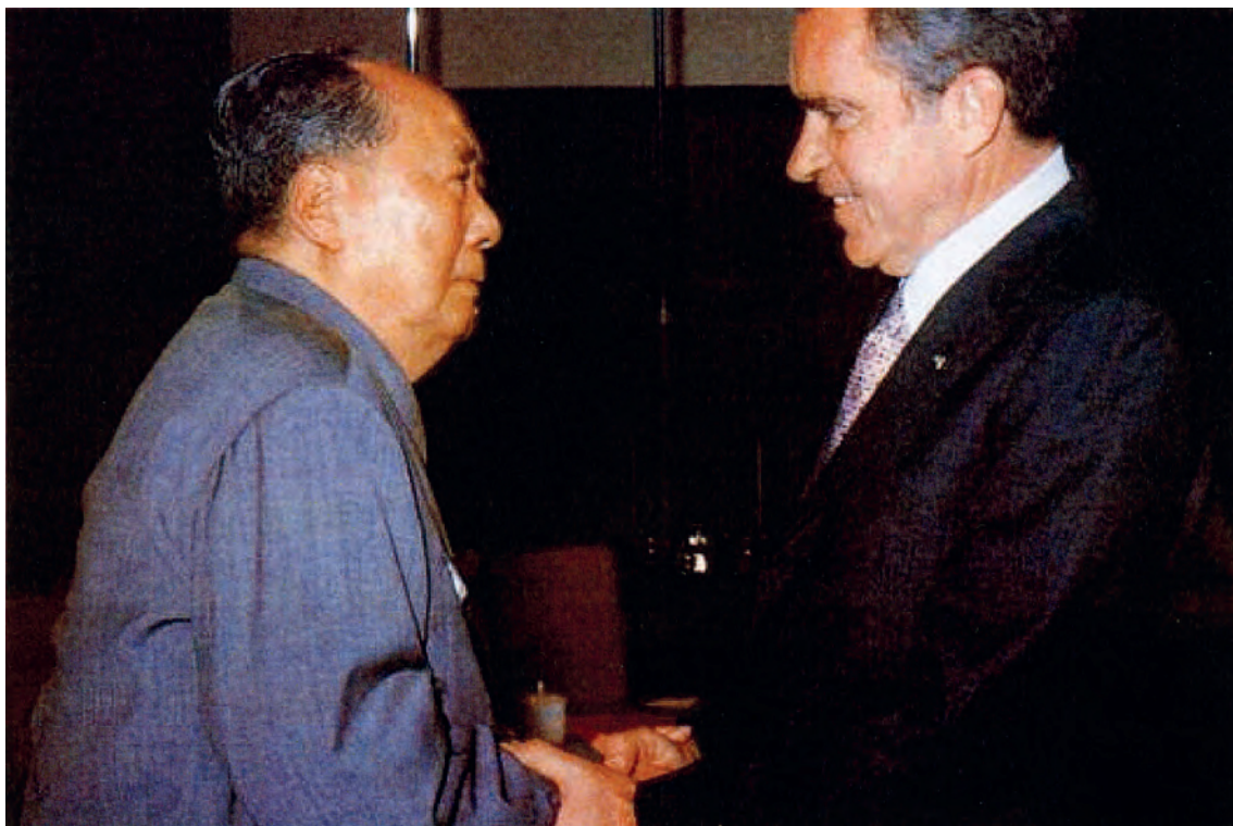
A photograph of Mao meeting with US President Nixon in 1972.

16 Look at the photograph, and then answer the questions which follow.