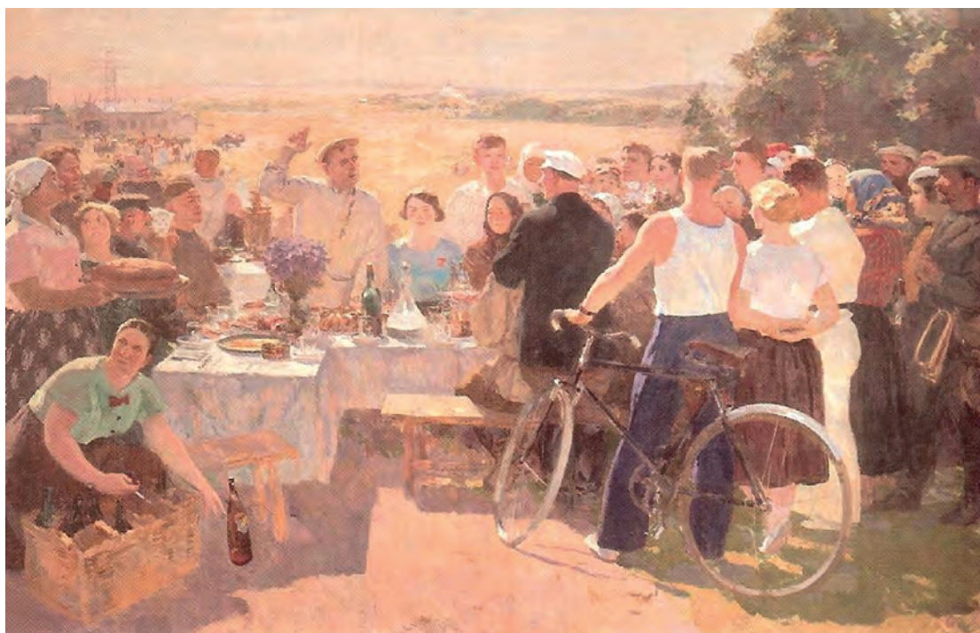
A Soviet painting from 1937, showing life on a collective farm.

12 Look at the painting, and then answer the questions which follow.