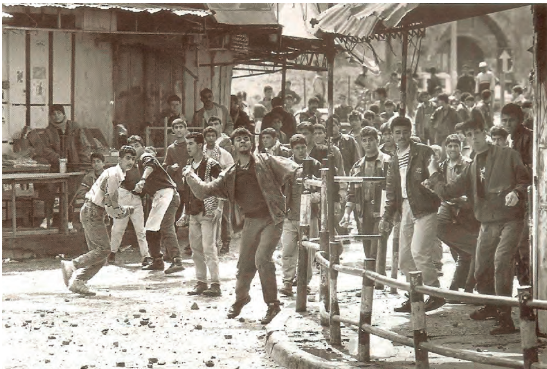
A photograph of young Palestinians throwing stones at Israeli soldiers in Gaza in 1987.

21 Look at the photograph, and then answer the questions which follow.