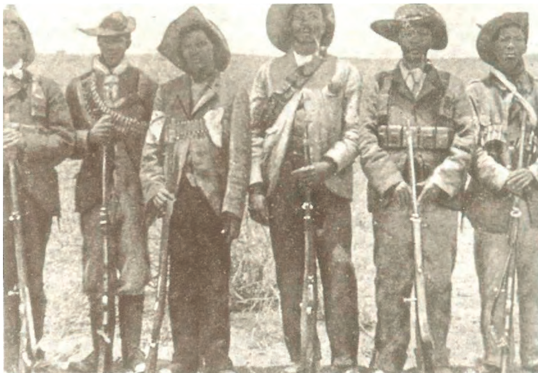
A photograph of Marenga and his guerrilla fighters in 1904.

19 Look at the photograph, and then answer the questions which follow.