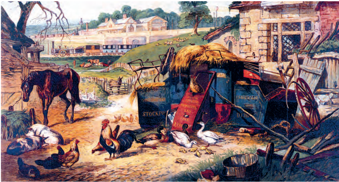
A painting of a country scene produced around 1845.

22 Look at the painting, and then answer the questions which follow.