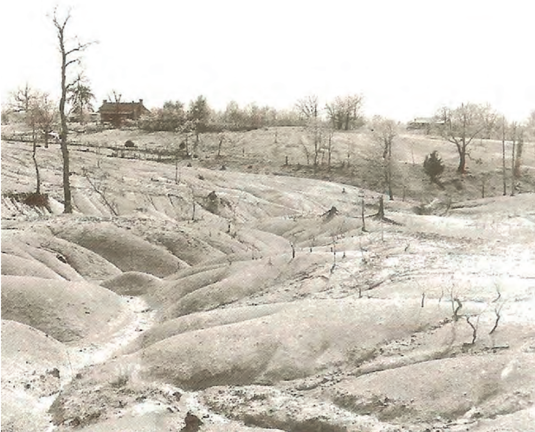
A photograph showing the effects of erosion in the Tennessee Valley.

14 Look at the photograph, and then answer the questions which follow.