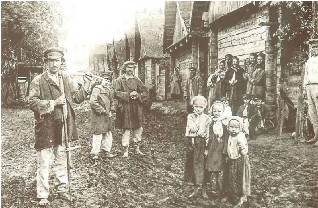
A photograph of a Russian village street around the beginning of the twentieth century.

11 Look at the photograph, and then answer the questions which follow.