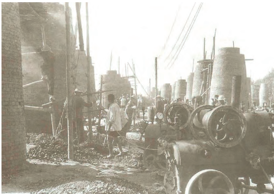
A photograph of 'Backyard Furnaces' in use during the Great Leap Forward.

15 Look at the photograph, and then answer the questions which follow.