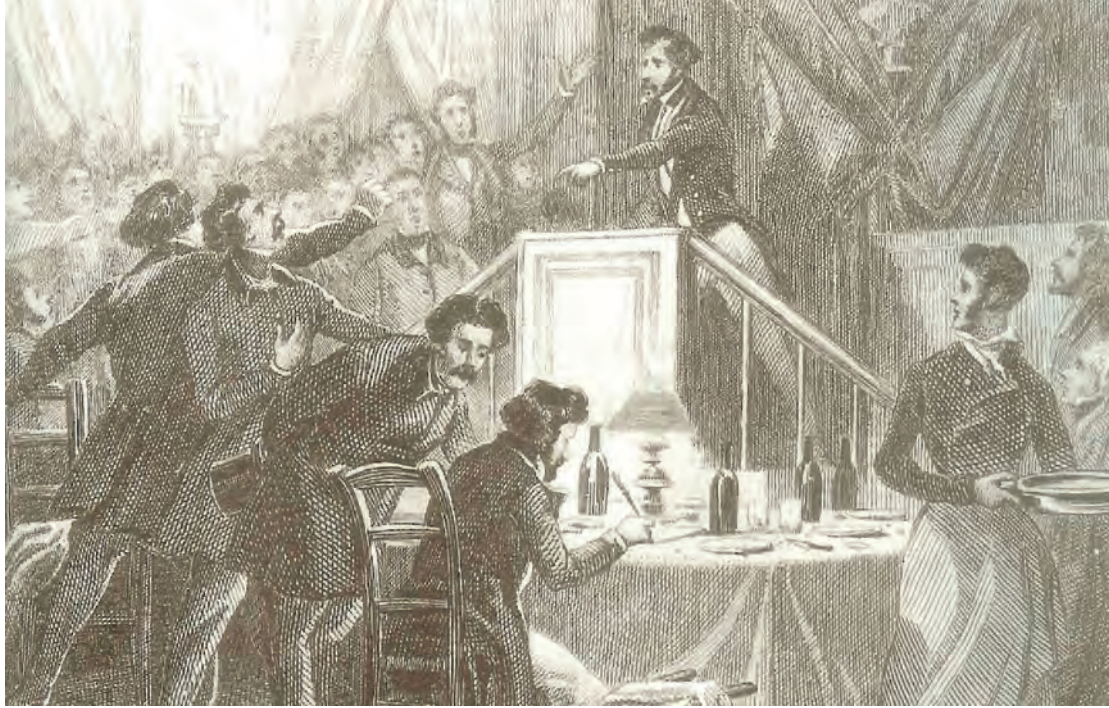
An illustration of a reform banquet held in Paris in 1847.