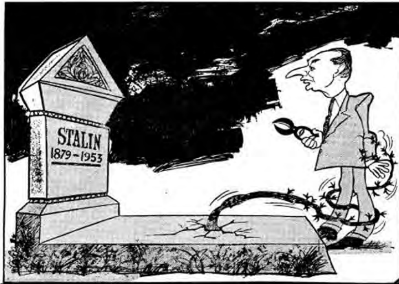
A British cartoon published on 23 July 1968. The figure on the right is Dubcek.