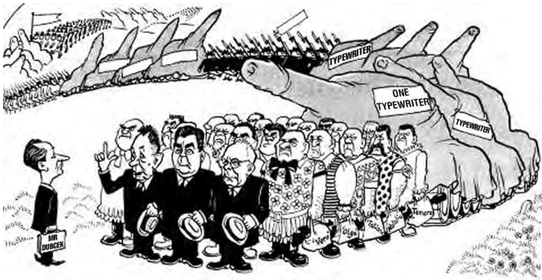
A British cartoon published on 24 July 1968. The leading figures facing Dubcek are Kosygin and Brezhnev. They are saying to Dubcek 'Of course, Mr Dubcek, we've had to bring a few lady secretaries and some tea boys.'