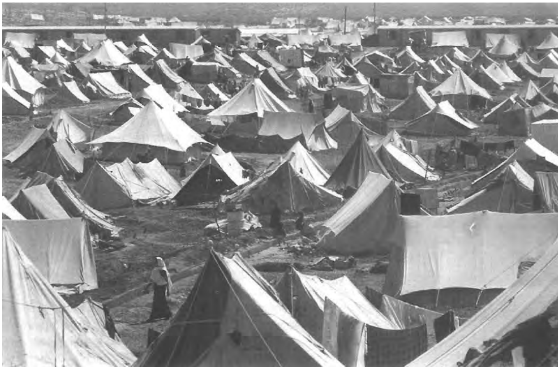
A photograph of a Palestinian refugee camp in Jordan in 1949.

21 Look at the photograph, and then answer the questions which follow.