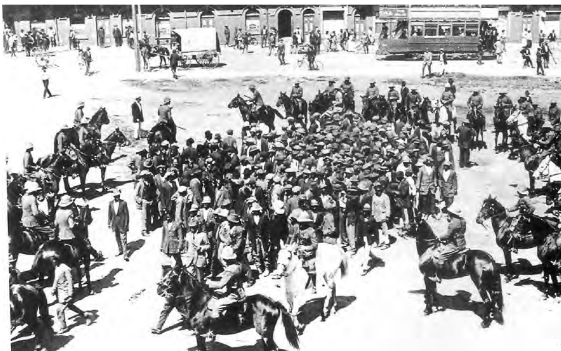
A photograph of anti-pass demonstrators in Johannesburg in 1919. All the people in the crowd are under arrest.

18 Look at the photograph, and then answer the questions which follow.