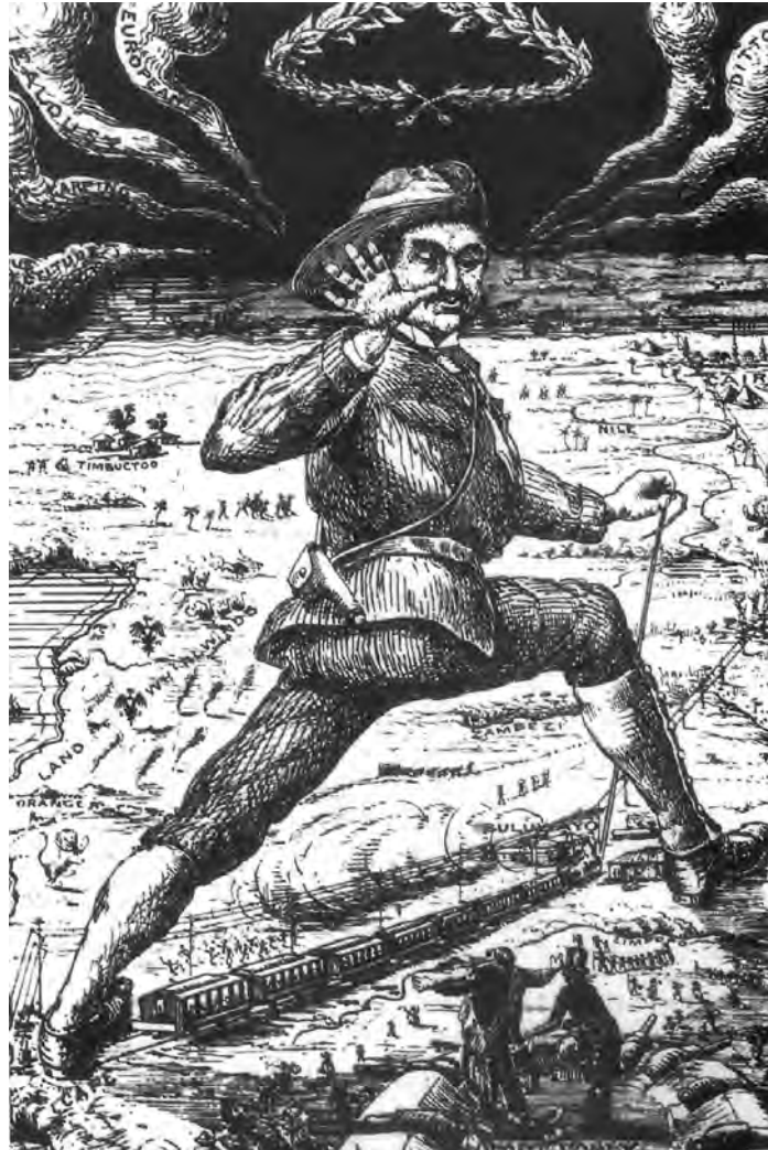
THE AMBITIONS OF CECIL RHODES

17 Look at the cartoon, and then answer the questions which follow.