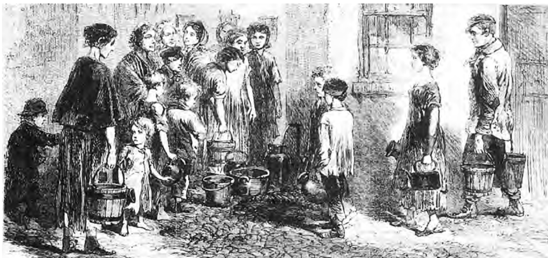
An engraving from 1862 showing daily life in an industrial town.

22 Look at the illustration, and then answer the questions which follow.