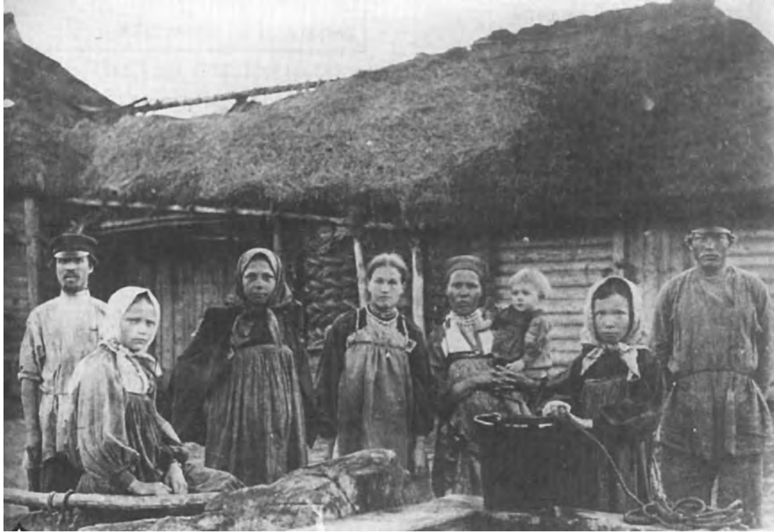
A photograph of a Russian peasant family outside their home in the early-twentieth century.

11 Look at the photograph, and then answer the questions which follow.