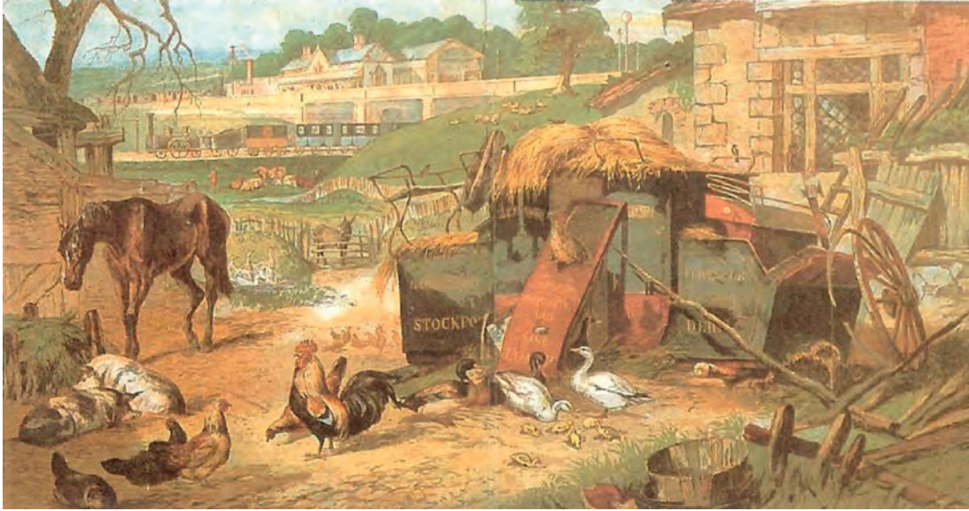
A painting from 1845 of a countryside scene.

22 Look at the painting, and then answer the questions which follow.