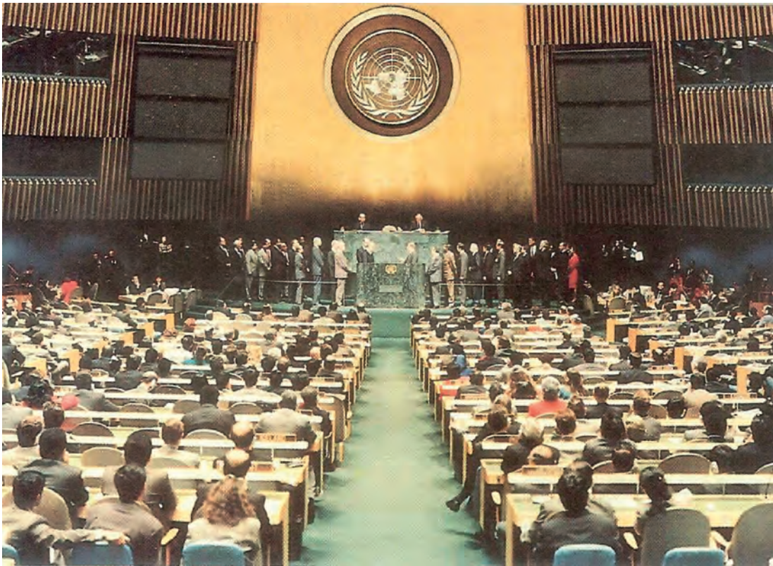
A photograph of the UNO General Assembly in session.

8 Look at the photograph, and then answer the questions which follow.