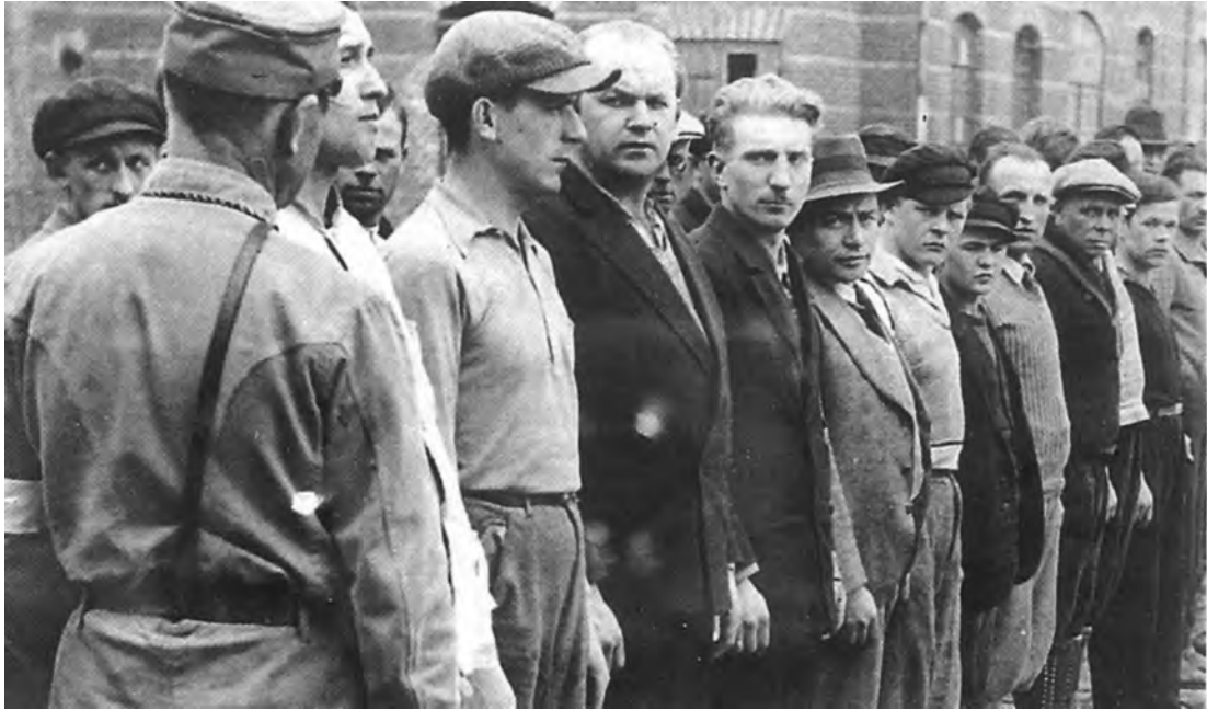
A photograph of political prisoners at the Oranienburg concentration camp near Berlin.

10 Look at the photograph, and then answer the questions which follow.