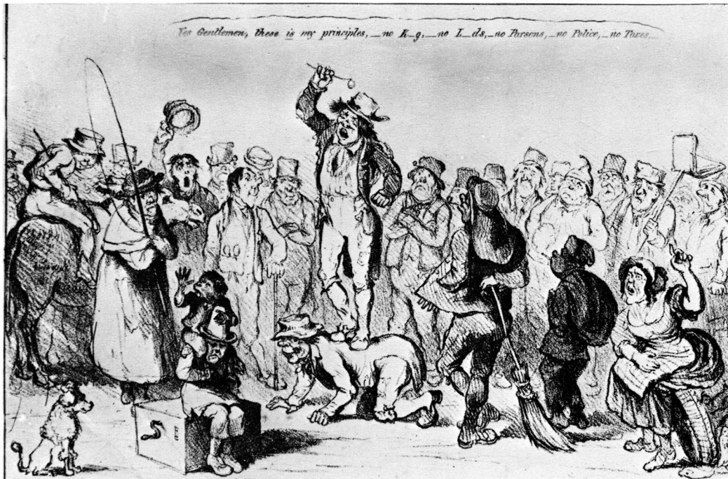
A cartoon of a trade union meeting in about 1830.

(The speaker's bubble reads, 'Yes, gentlemen, these is my principles: no King, no Lords, no Parsons, no Police, no Taxes...')