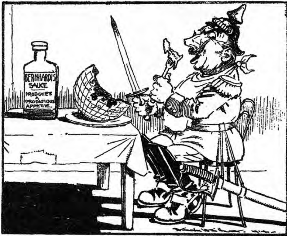
A cartoon published in Britain early in 1914. It is entitled 'The Kaiser's Dream: The End of the World'. Bernhardt was a German general who wrote a best-selling book entitled 'Germany and the Next War'.