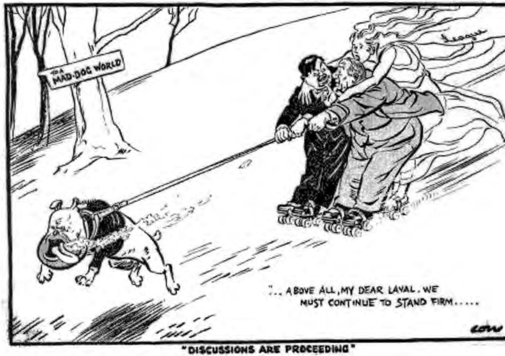
A British cartoon published in August 1935. The two men are Laval and Baldwin (Prime Minister of Britain).