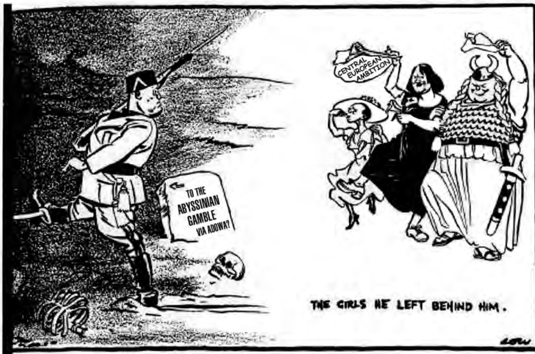
A British cartoon published in May 1935. The three figures on the right are Hitler and two of his leading ministers.