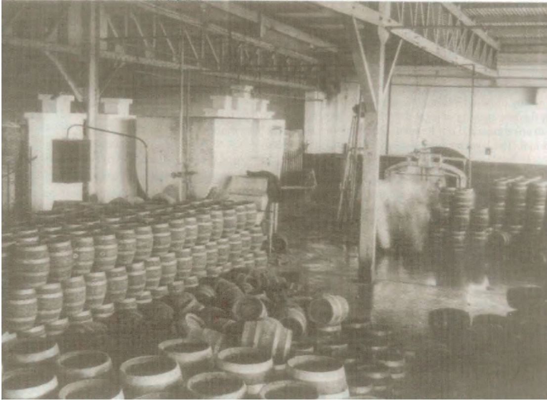
A photograph of an illegal still.

13 Look at the photograph, and then answer the questions which follow.