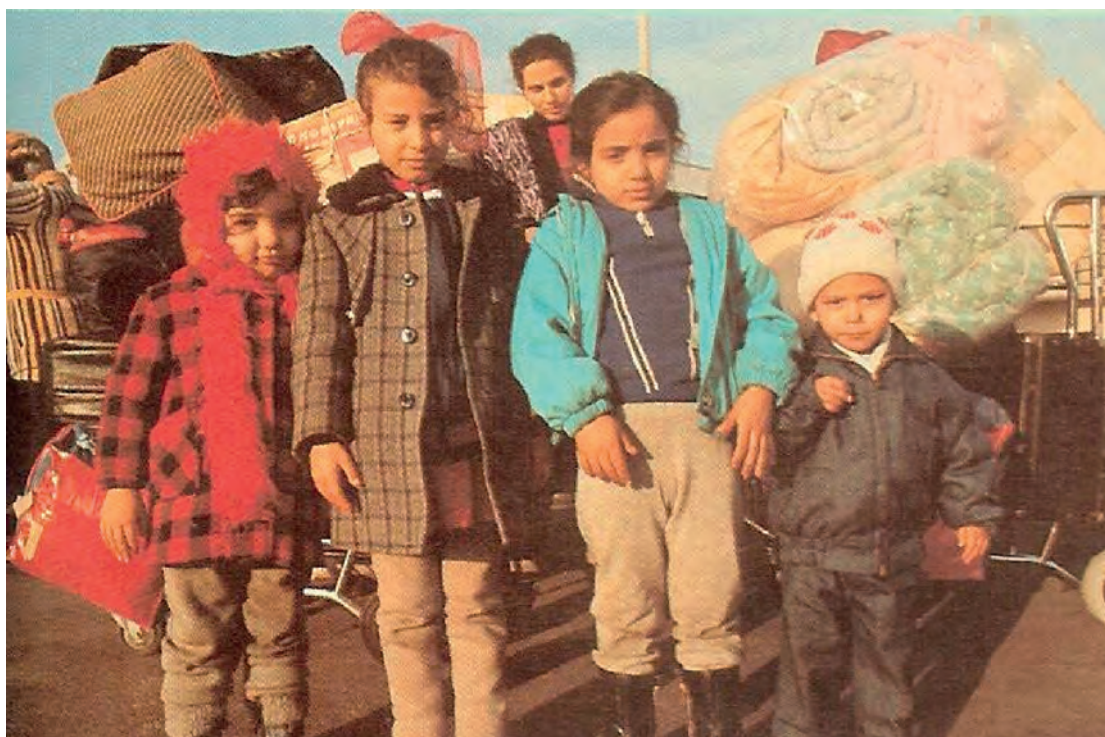
A photograph of Jewish children arriving at Ben-Gurion Airport in Israel in 1990. They have just arrived from the Soviet Union.

21 Look at the photograph, and then answer the questions which follow.