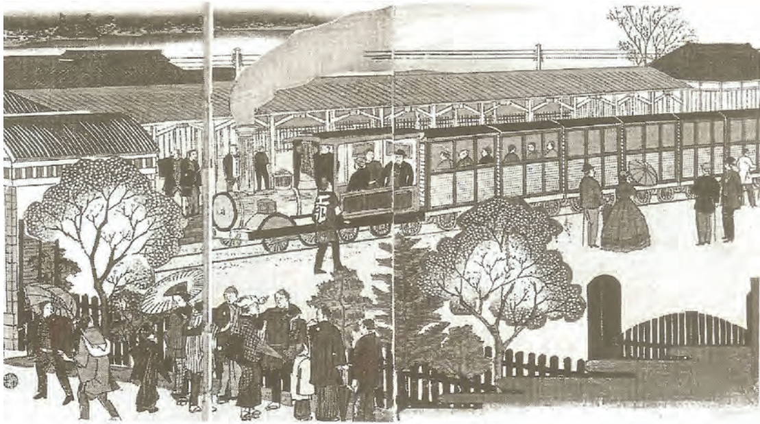
A print of the first Japanese railway, built in 1872.

4 Look at the picture, and then answer the questions which follow.