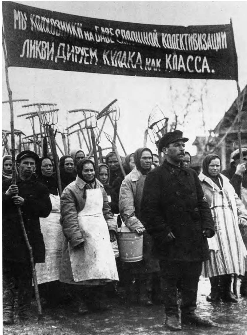
A group of peasants carrying a banner with the inscription, 'We demand collectivisation and the liquidation of the kulaks as a class', 1931.