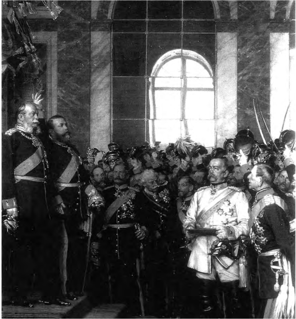
A painting entitled 'The Proclamation of the German Empire'. This is the third version of this painting and was painted in 1885 to celebrate Bismarck's seventieth birthday. The original version was painted in 1871 and showed the occasion as dull, with Bismarck in a less important position. In this version Bismarck is the figure in white.