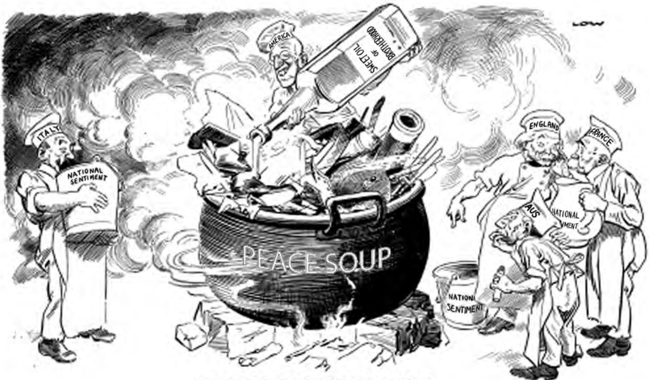
THE MELTING POT.

An Australian cartoon published in 1919.