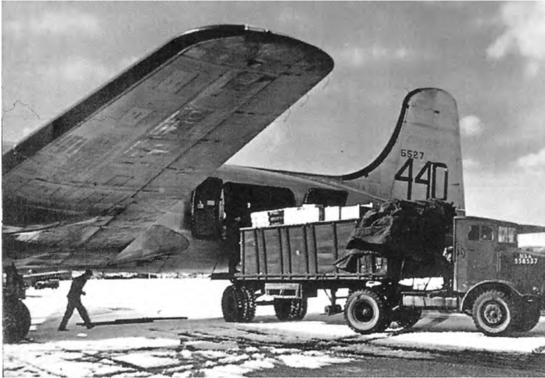
A photograph of supplies being unloaded from an American aircraft during the Berlin Blockade.