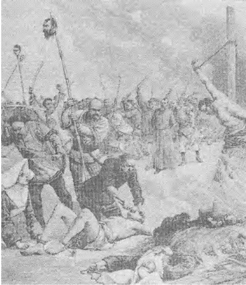
An illustration from a French magazine of 1891 showing massacres of European Christians and missionaries in China.

24 Look at the illustration, and then answer the questions which follow.