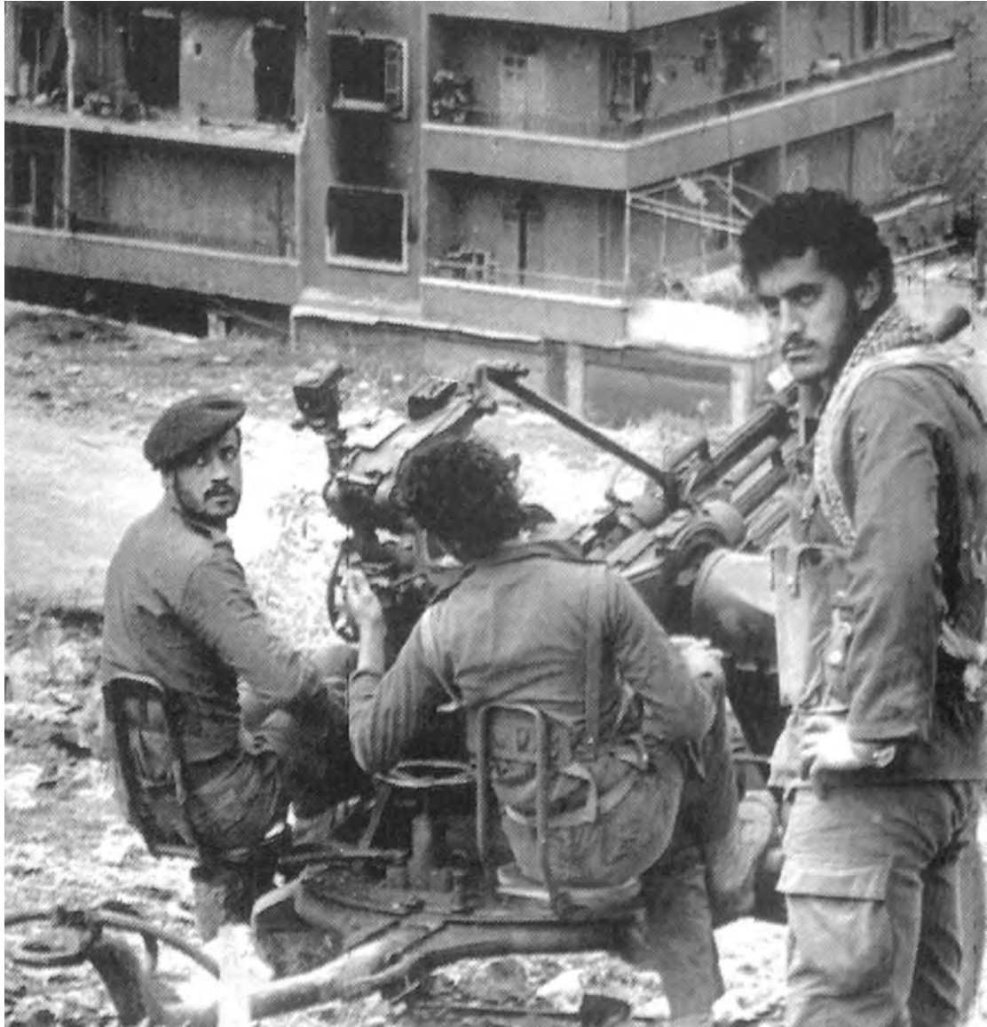
A PLO anti-aircraft gun in Beirut, Lebanon, 1983.

21 Look at the photograph, and then answer the questions which follow.