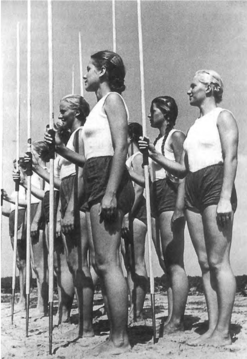
Javelin throwers in the League of German Maidens.

10 Look at the photograph, and then answer the questions which follow.