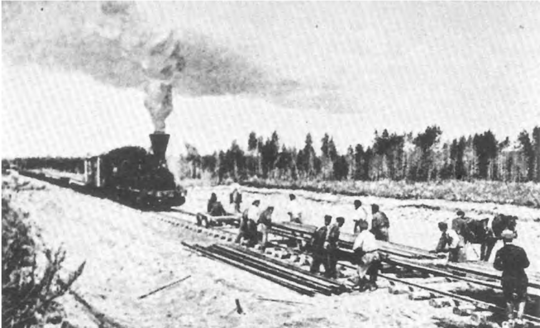
Russian workers laying the final lengths of track for the Trans-Siberian Railway.