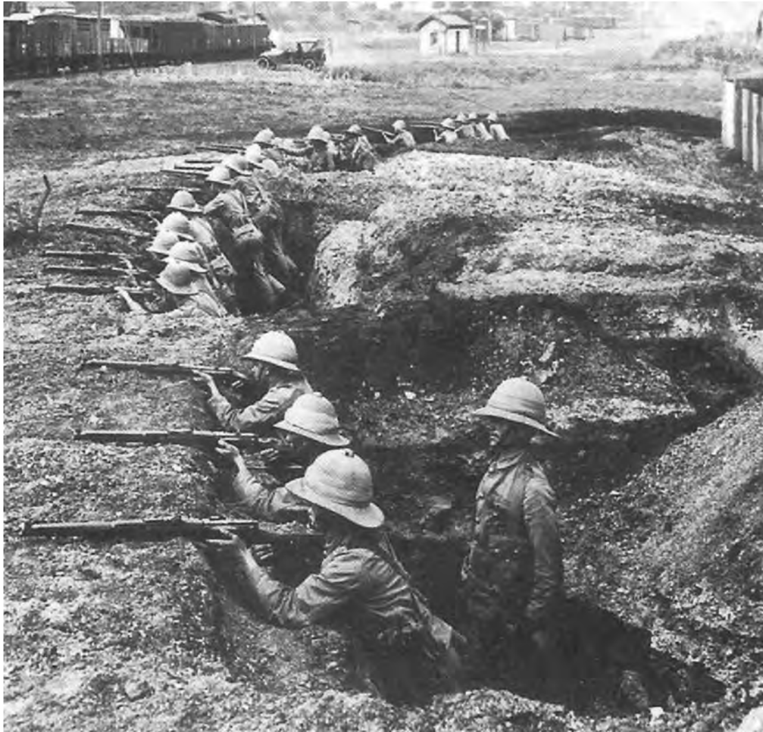
Government soldiers facing striking mine-workers in Johannesburg, 1922.

17 Look at the photograph, and then answer the questions which follow.