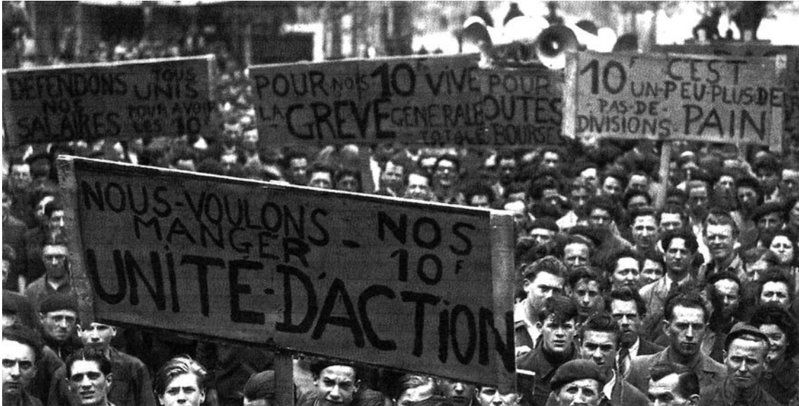
A photograph of workers in Paris demonstrating in 1947 for more pay, more bread and more united action by left-wing groups.