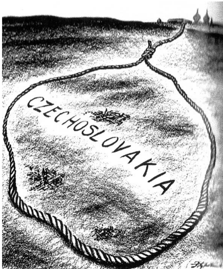
An American cartoon published in 1947. The title of the cartoon is 'When the time is right'.