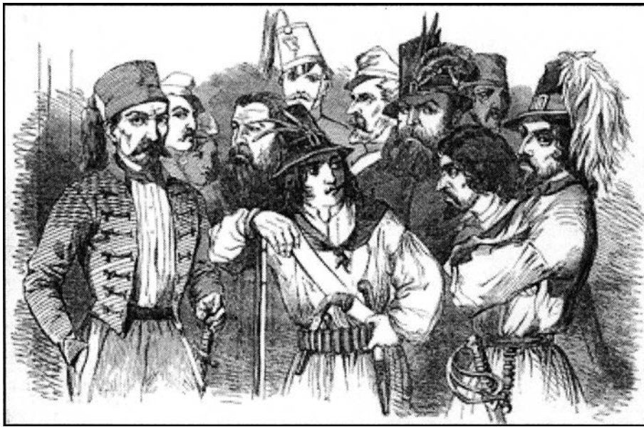
A drawing entitled 'Rome – Garibaldi's Men', published in an English magazine in July 1849.