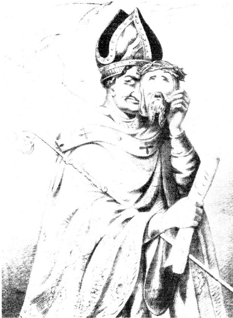
A cartoon of Pope Pius IX, published in Italy in 1852.