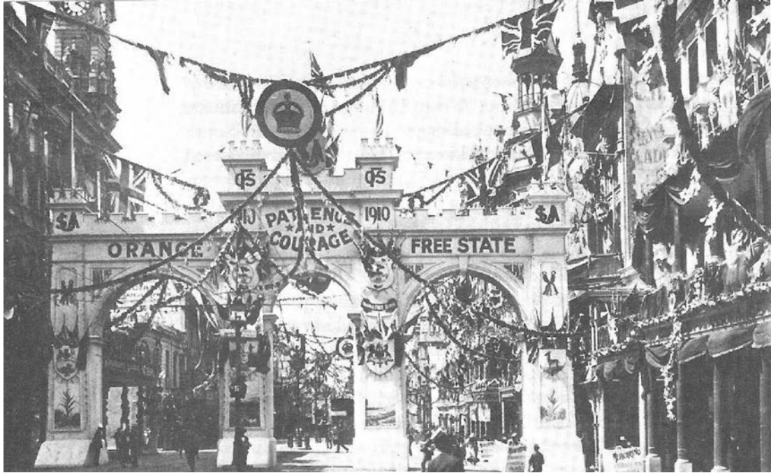
A photograph showing celebrations in South Africa on the creation of the Union, 1910.

17 Study the photograph, and then answer the questions which follow.