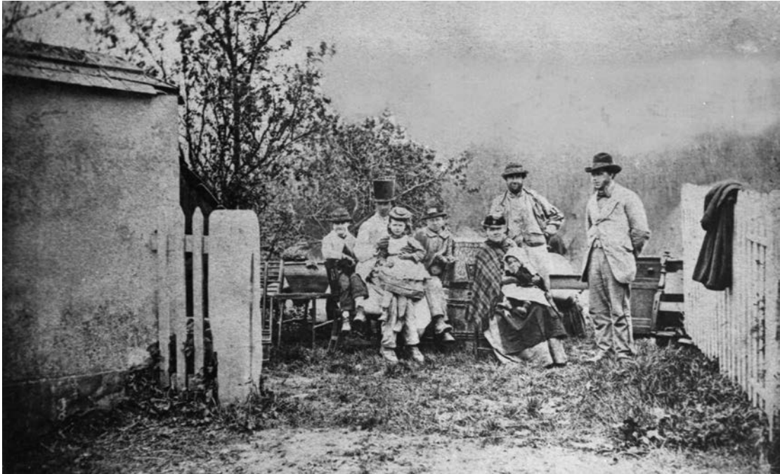
Farm labourers evicted from their home for being members of the National Agricultural Labourers' Union, 1874.

23 Study the picture, and then answer the questions which follow.