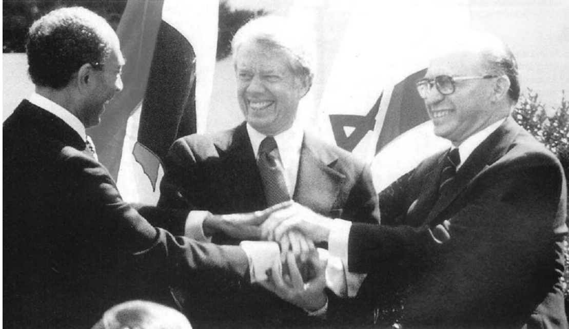
President Carter, President Sadat and Prime Minister Begin after signing a peace treaty in March 1979.

20 Study the photograph, and then answer the questions which follow.