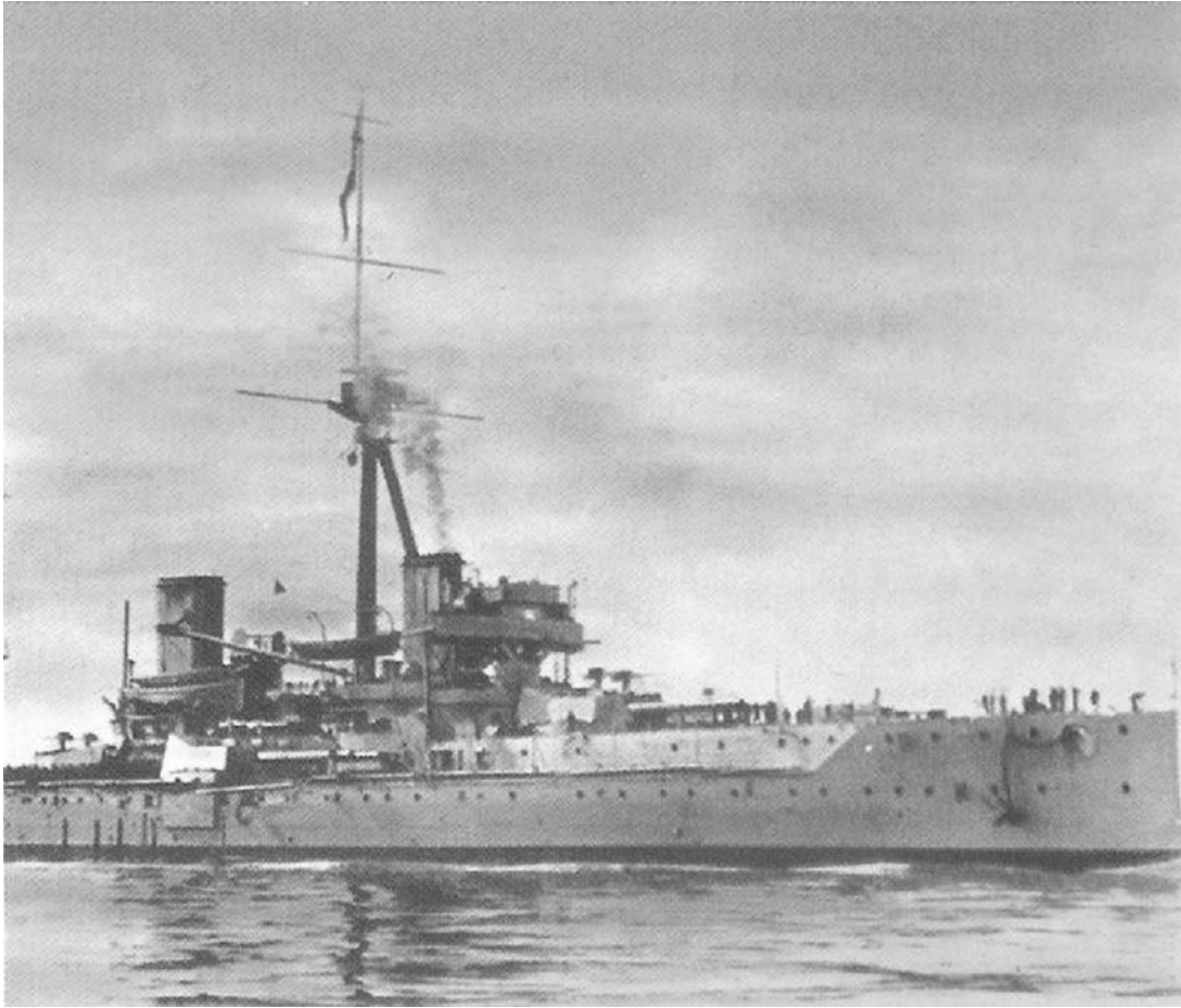
The British battleship HMS Dreadnought, launched in 1906.

4 Study the picture, and then answer the questions which follow.