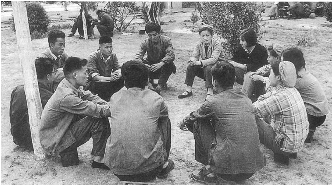
Chinese citizens taking part in a 'thought reform' meeting.

16 Study the photograph, and then answer the questions which follow.