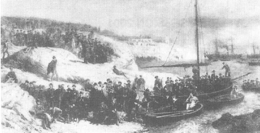
Garibaldi's expedition landing in Sicily.