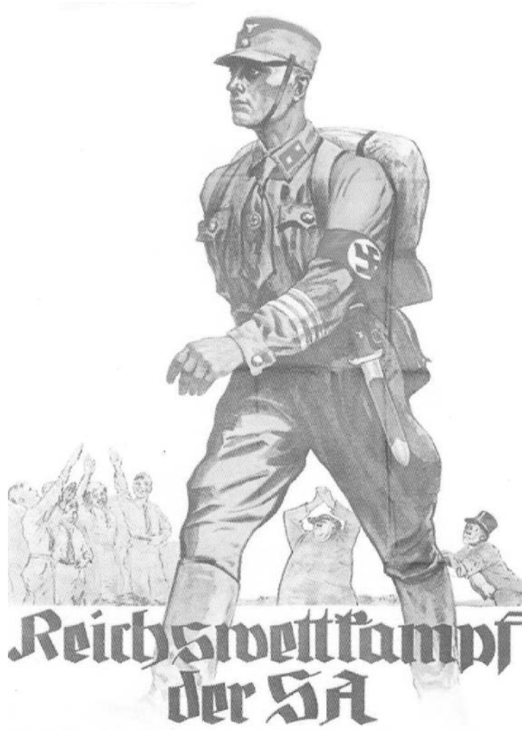
A Nazi propaganda poster about the SA.