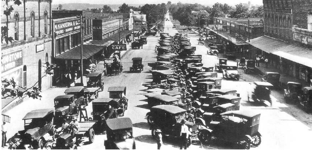
A street in Texas in 1925.

13 Study the photograph, and then answer the questions which follow.