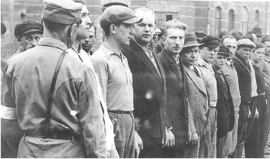
Political prisoners at the Oranienburg concentration camp near Berlin.

10 Study the photograph, and then answer the questions which follow.