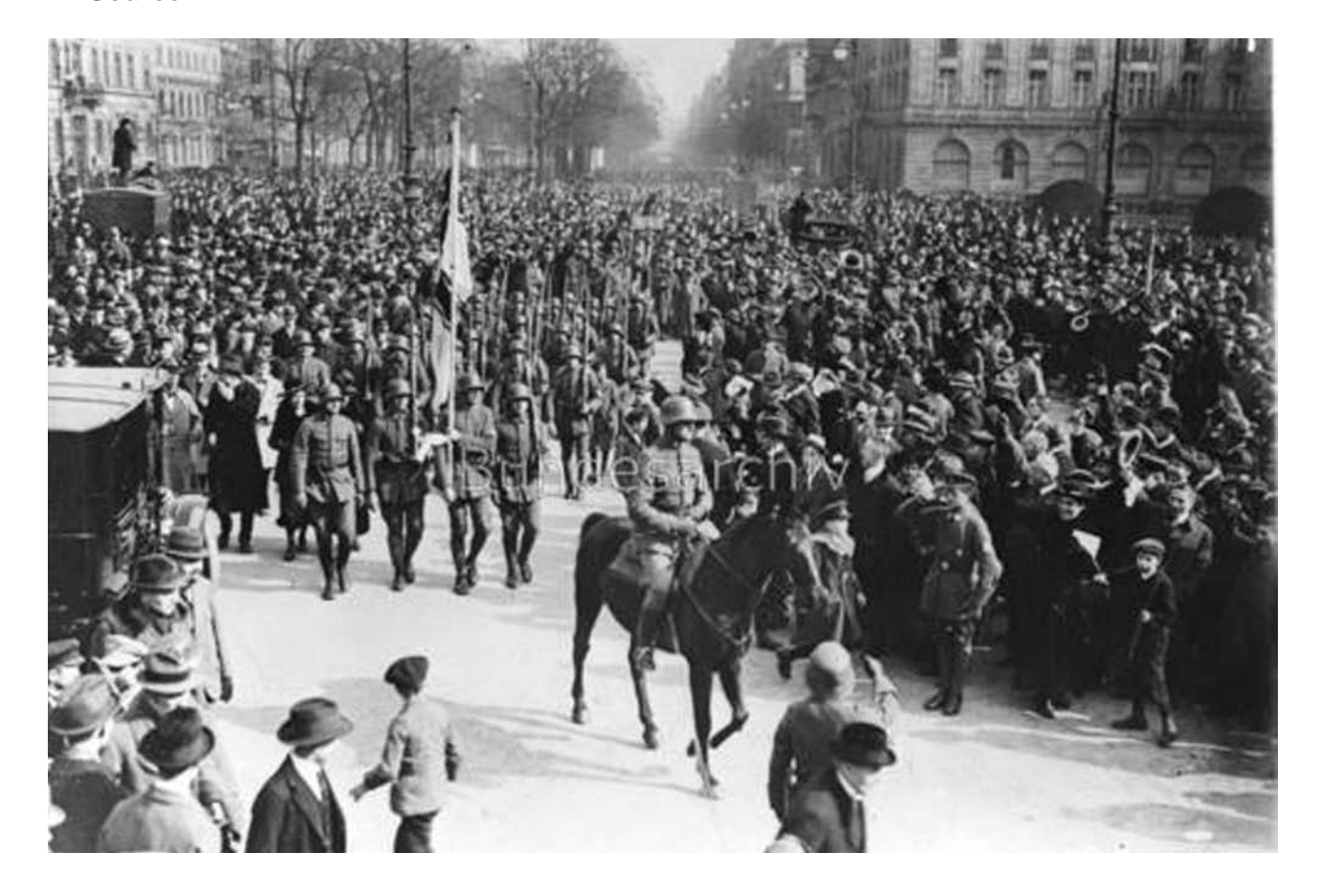
One of the Freikorps Brigades in Berlin, March 1920.