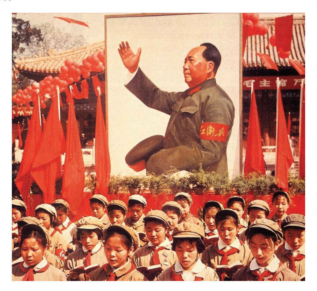
Red Guards read the teachings of Mao during the Cultural Revolution, beneath a poster of the Chinese leader.