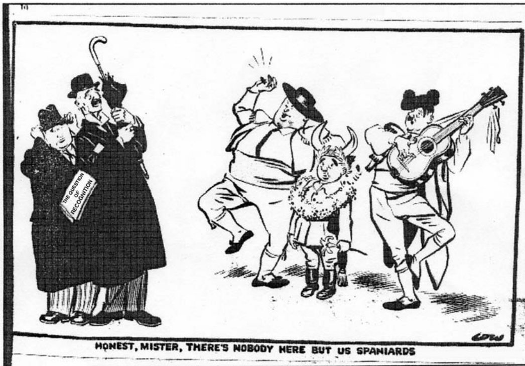
A cartoon published in Britain in February 1939. The figures on the left represent the British and French Governments. The figures on the right are Mussolini, Franco and Hitler.