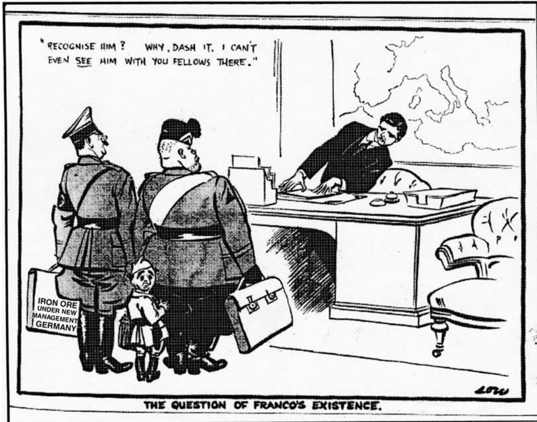
A cartoon published in Britain in July 1937. The figure behind the desk represents the British Government.