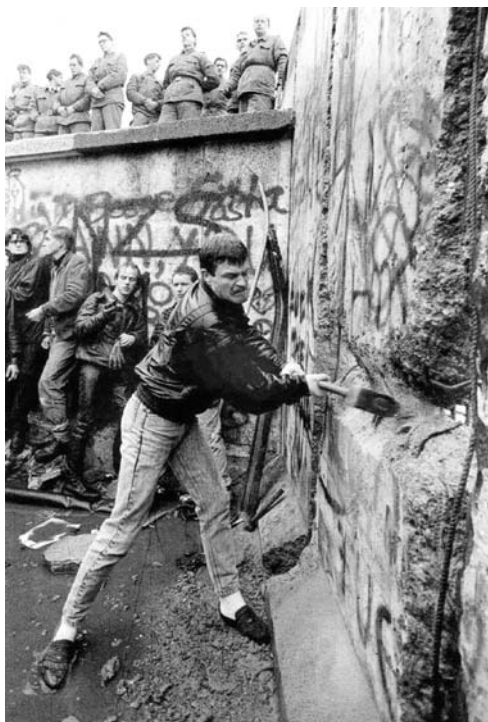
A photograph of events at the Berlin Wall in November 1989.