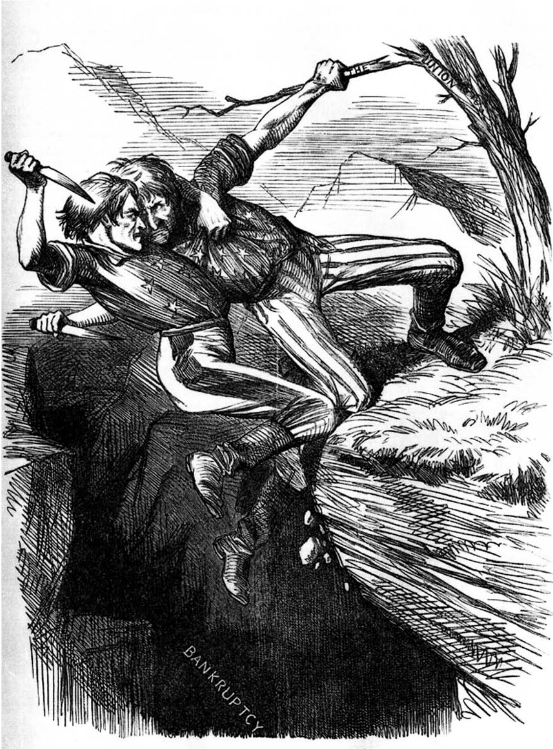
A cartoon from an English magazine, June 1862. The two figures represent the North and the South.