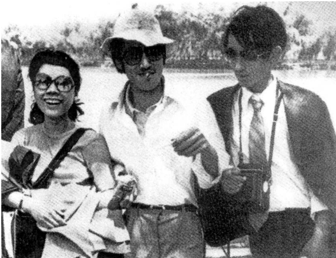
Young Chinese people on the streets of Beijing in the 1980s.

16 Study the photograph, and then answer the questions which follow.