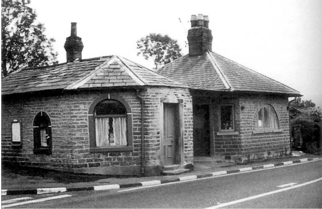
A picture of an eighteenth-century toll-house.

22 Study the photograph, and answer the questions which follow.