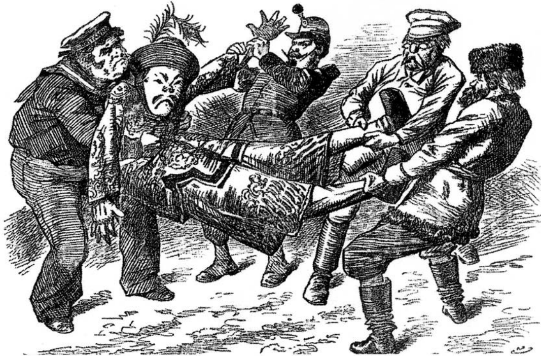
A nineteenth-century cartoon showing China being pulled in different directions by several European countries.

24 Study the cartoon, and then answer the questions which follow.