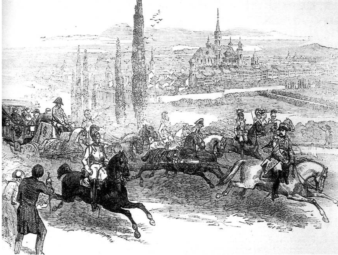
The Emperor of Austria abandoning Vienna and heading to Innsbruck, May 1848.