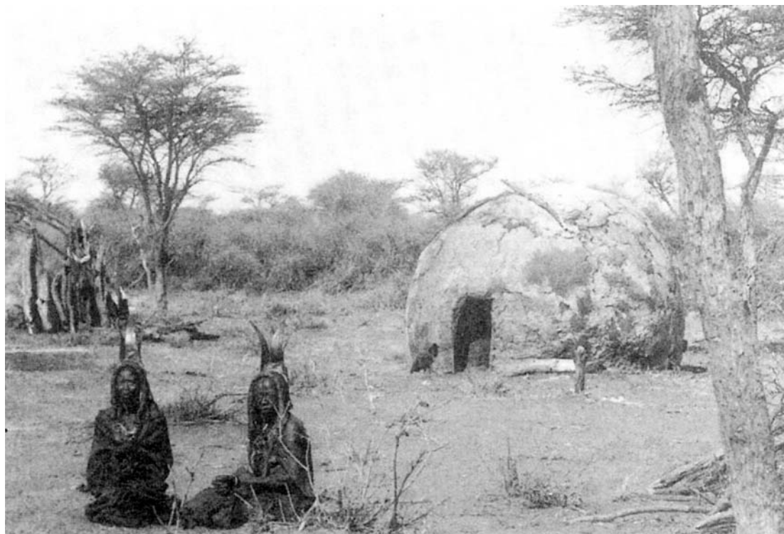
Part of a Herero settlement.

19 Study the picture, and then answer the questions which follow.