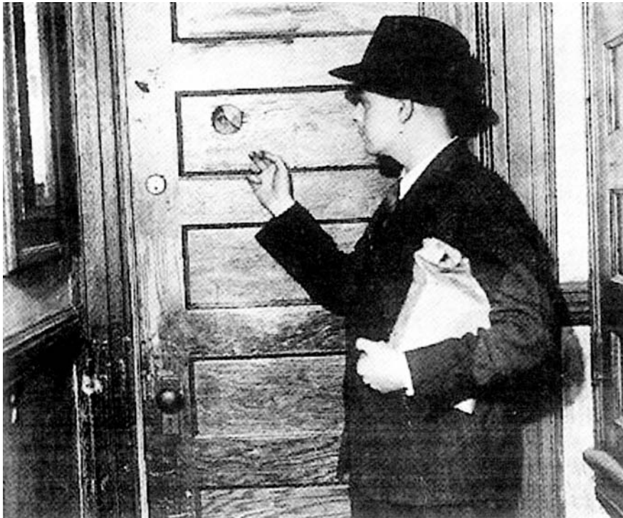
An American visiting a speakeasy.

13 Study the photograph, and then answer the questions which follow.