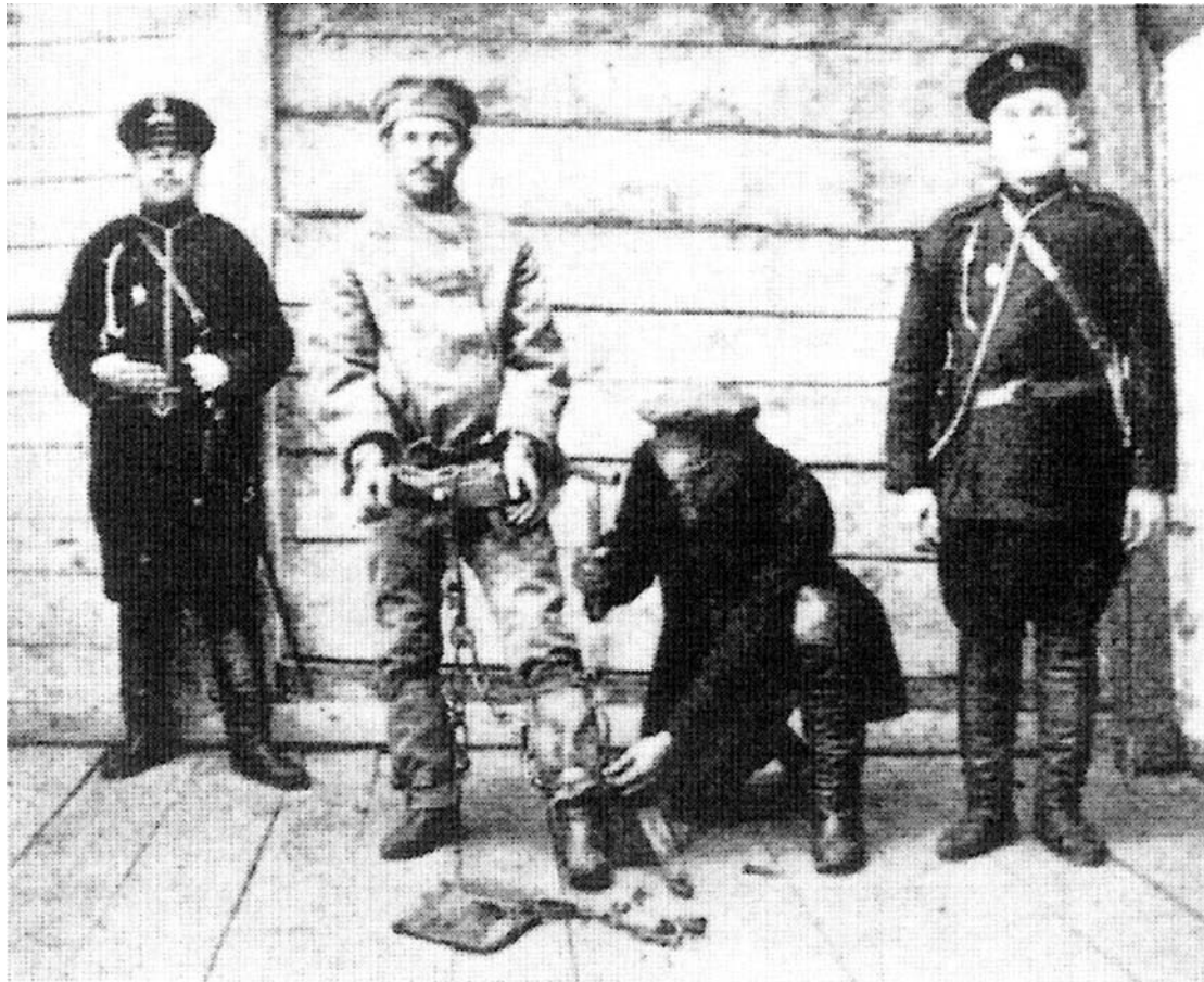
A prisoner of the Okhrana.

11 Study the photograph, and then answer the questions which follow.