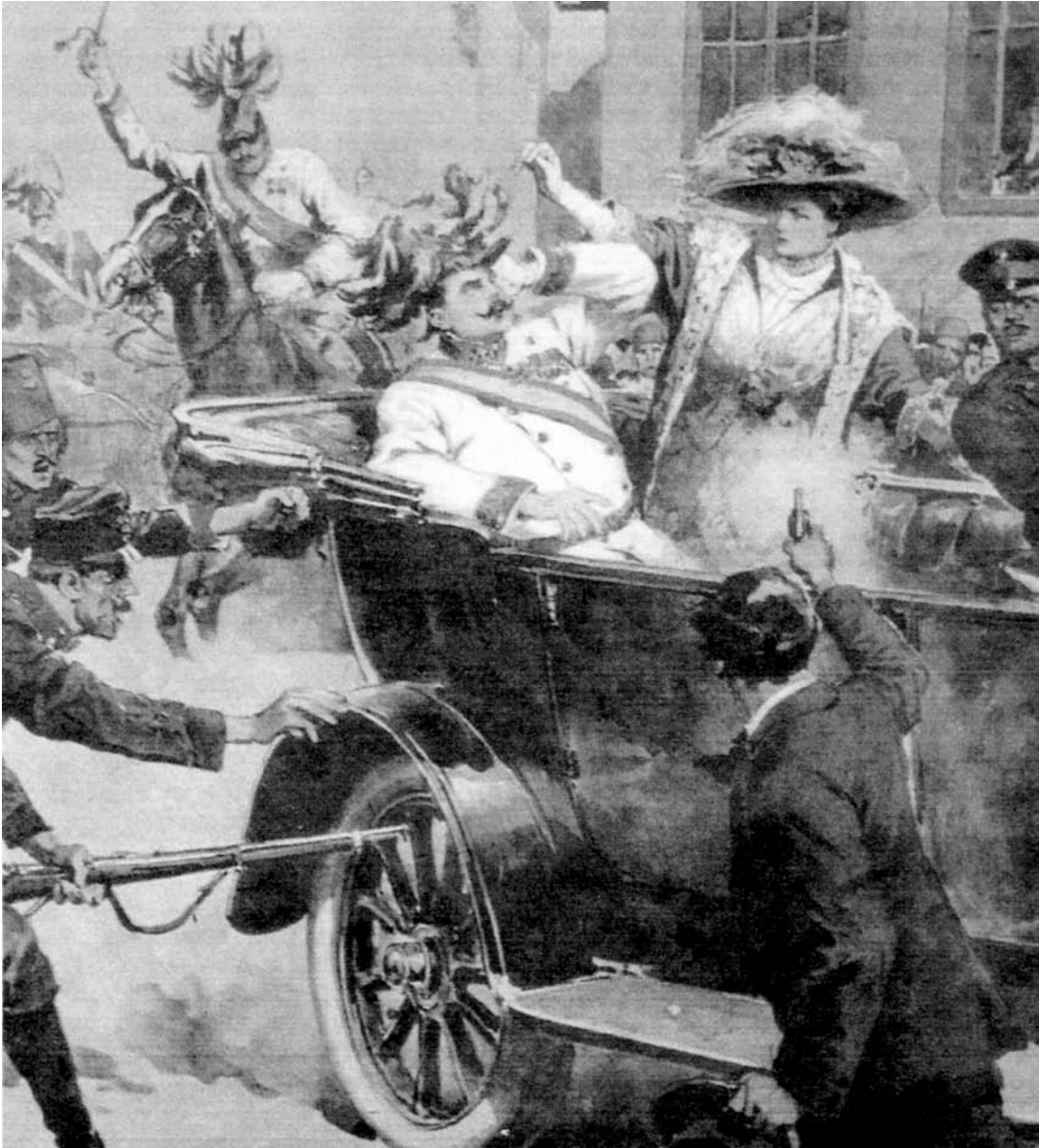
An illustration of the assassination of Franz Ferdinand and his wife in Sarajevo, June 1914.

4 Study the illustration, and then answer the questions which follow.