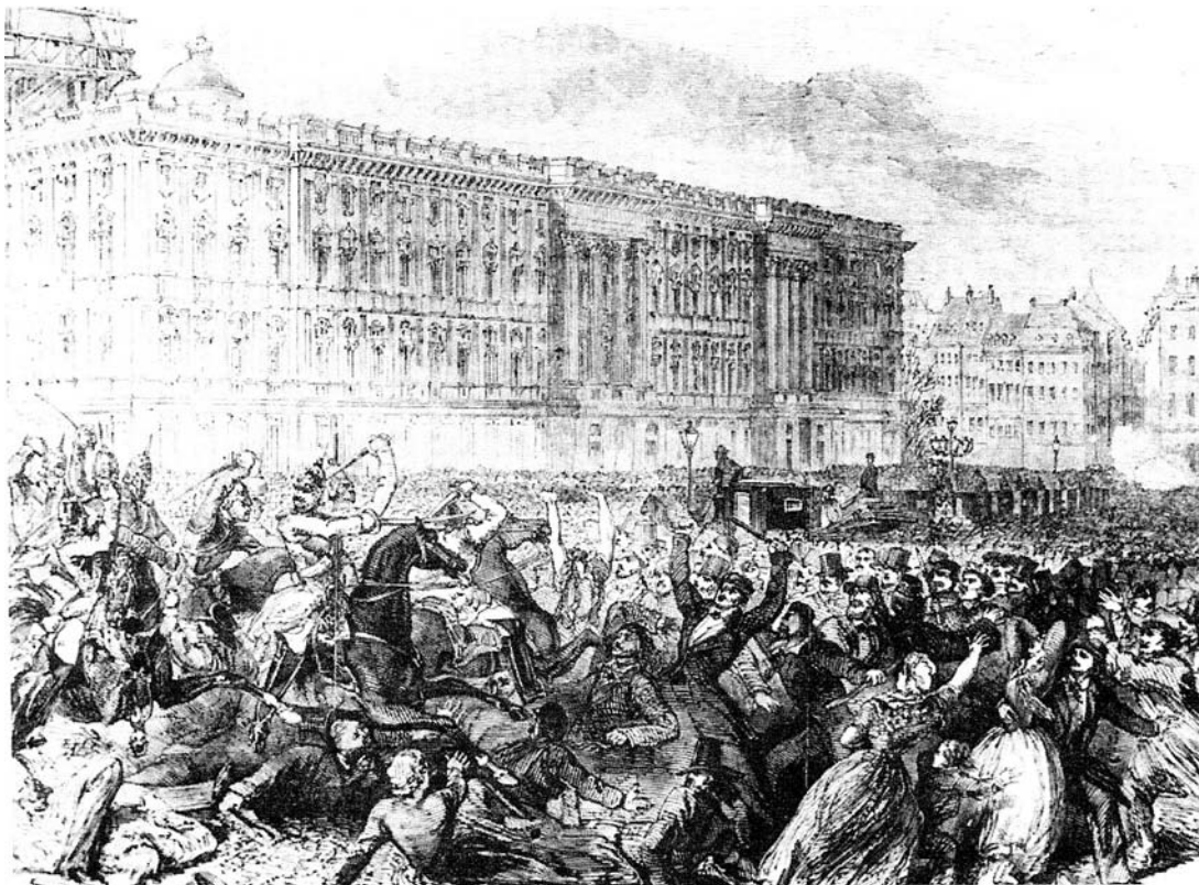
A picture showing the Prussian cavalry charging rioters in front of the Royal Palace in Berlin in 1848.