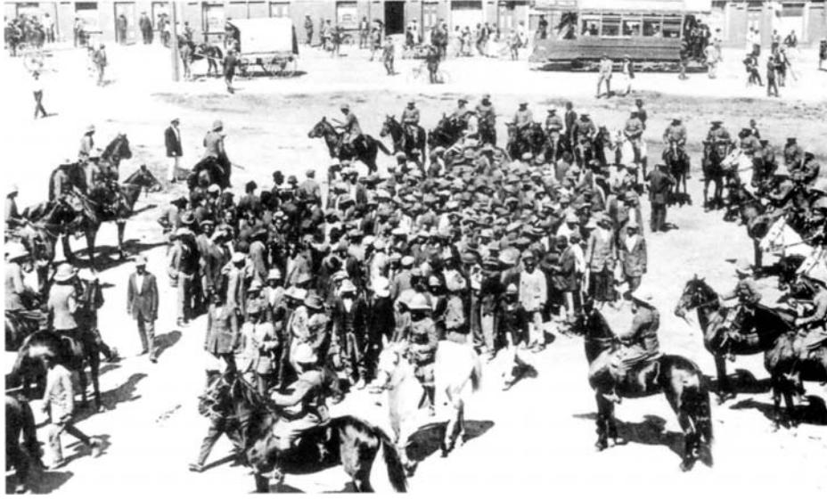
Anti-pass demonstrators being arrested in Johannesburg, 1919.

17 Study the photograph, and then answer the questions which follow.