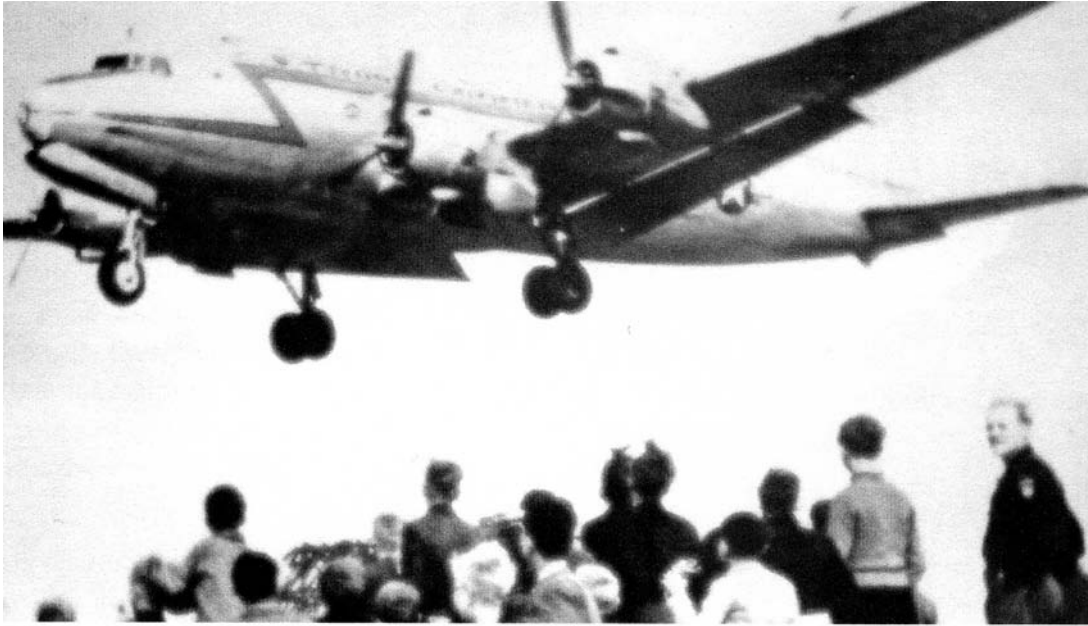
West Berliners watching a US cargo plane landing.