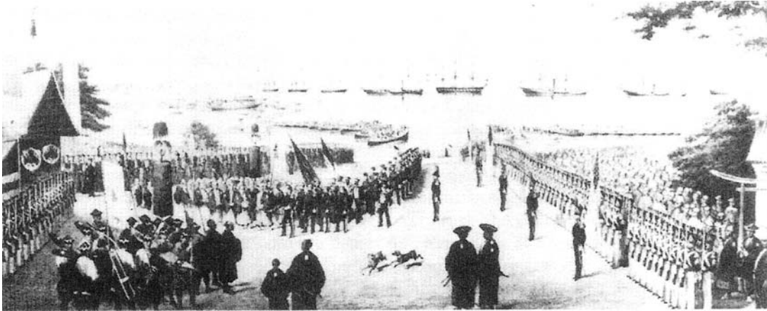
The Americans arrive to sign the Treaty of Kanagawa, 1854.