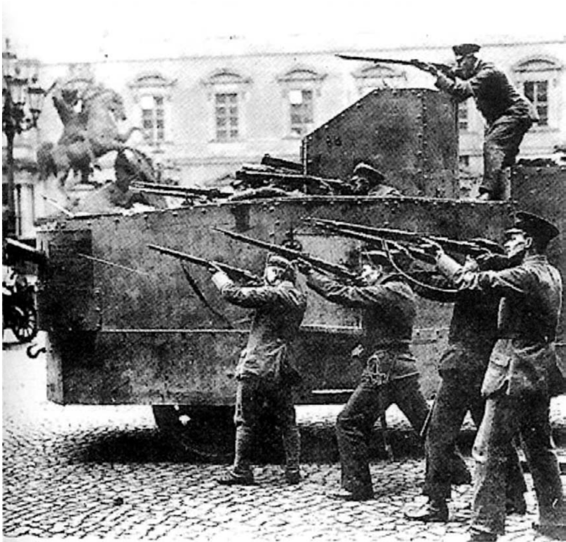
The Freikorps in action in 1919.