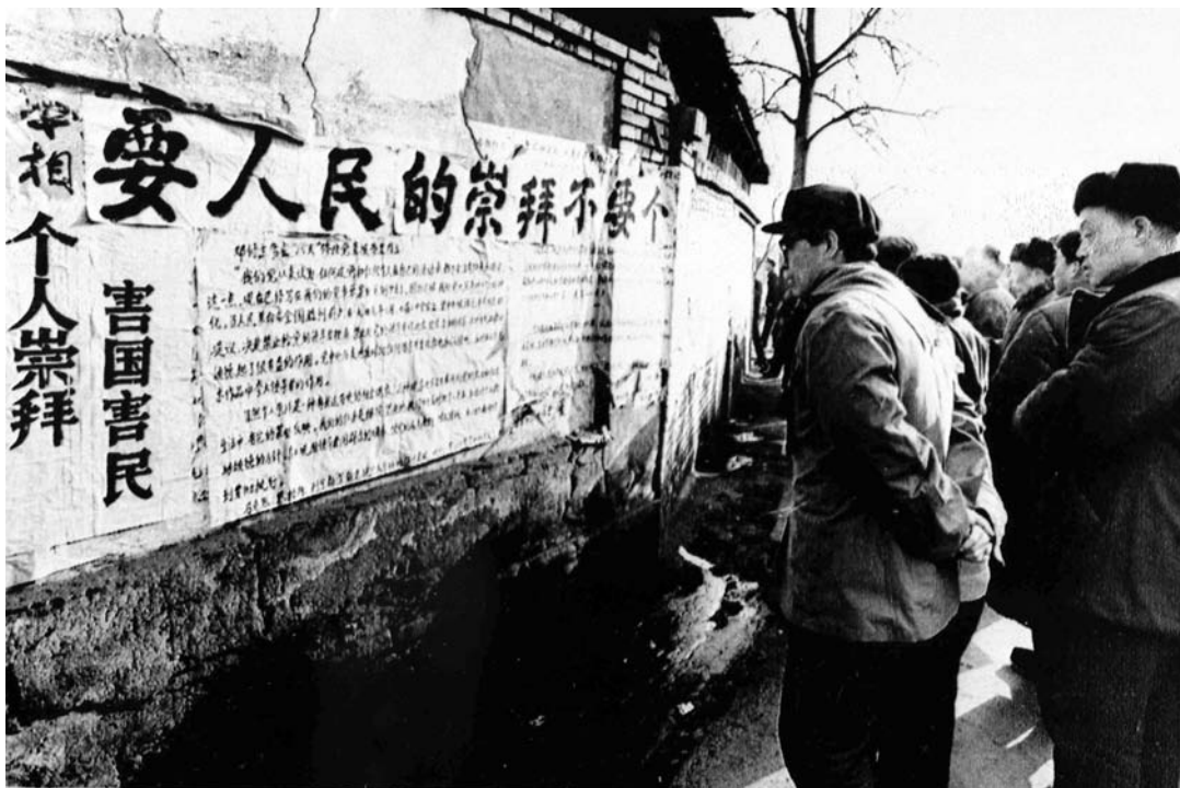
The 'Democracy Wall' in Beijing, 1979.

16 Study the photograph, and then answer the questions which follow.