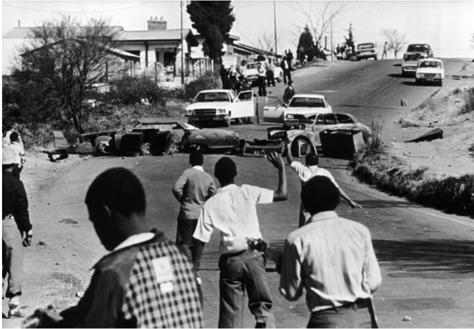
High school students on the streets of Soweto, 1976.

18 Study the photograph, and then answer the questions which follow.