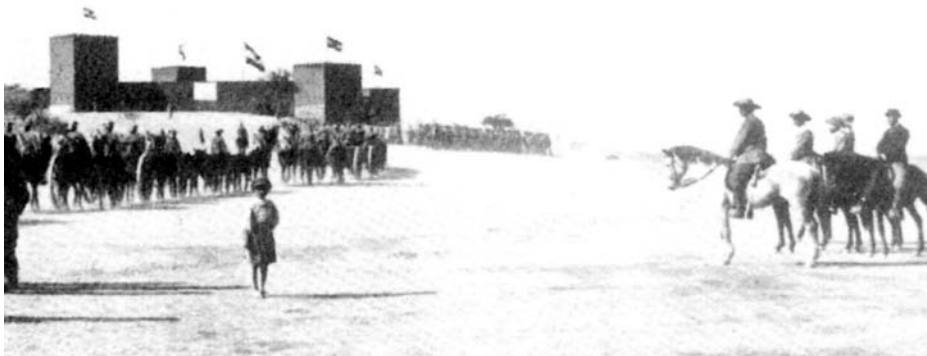
The German fort at Windhoek, 1898.

19 Study the photograph, and then answer the questions which follow.