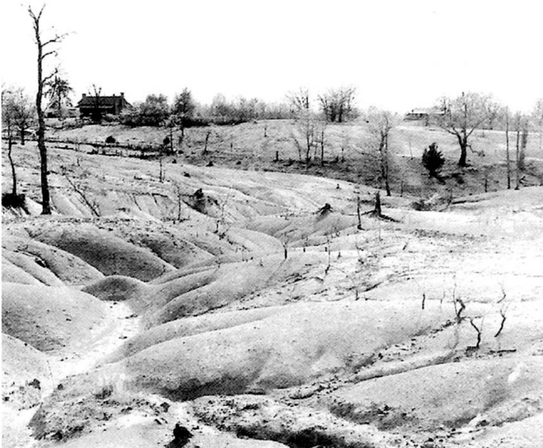
Effects of erosion in the Tennessee Valley.

14 Study the photograph, and then answer the questions which follow.