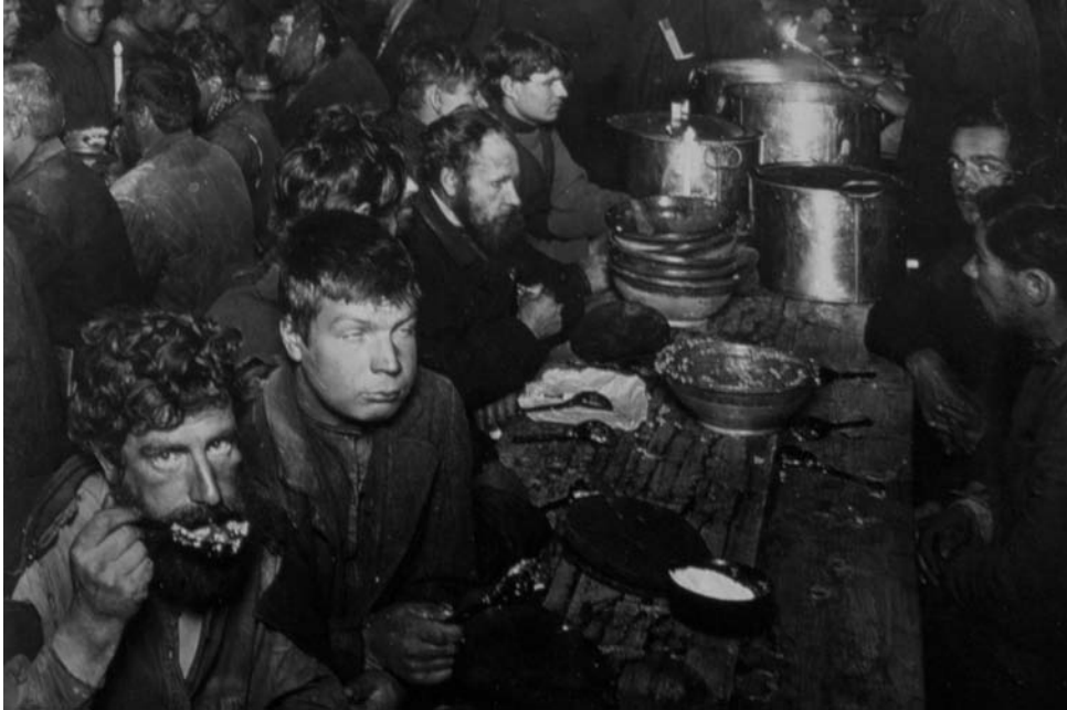
A boarding house for industrial workers, Moscow 1911.

11 Study the photograph, and then answer the questions which follow.