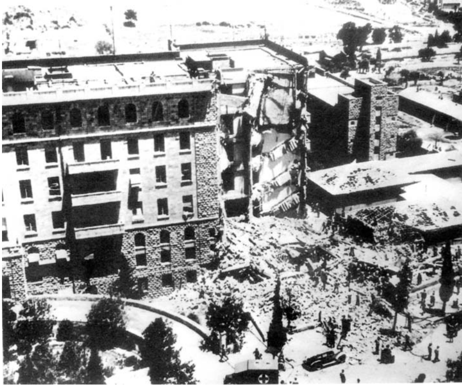
The King David Hotel in Jerusalem following a terrorist attack, 1946.

20 Study the photograph, and then answer the questions which follow.