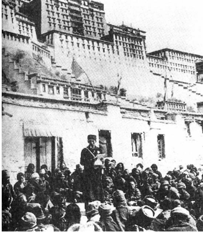
A Chinese Communist leader reads a proclamation to crowds of Tibetans in 1959.

15 Study the picture, and then answer the questions which follow.