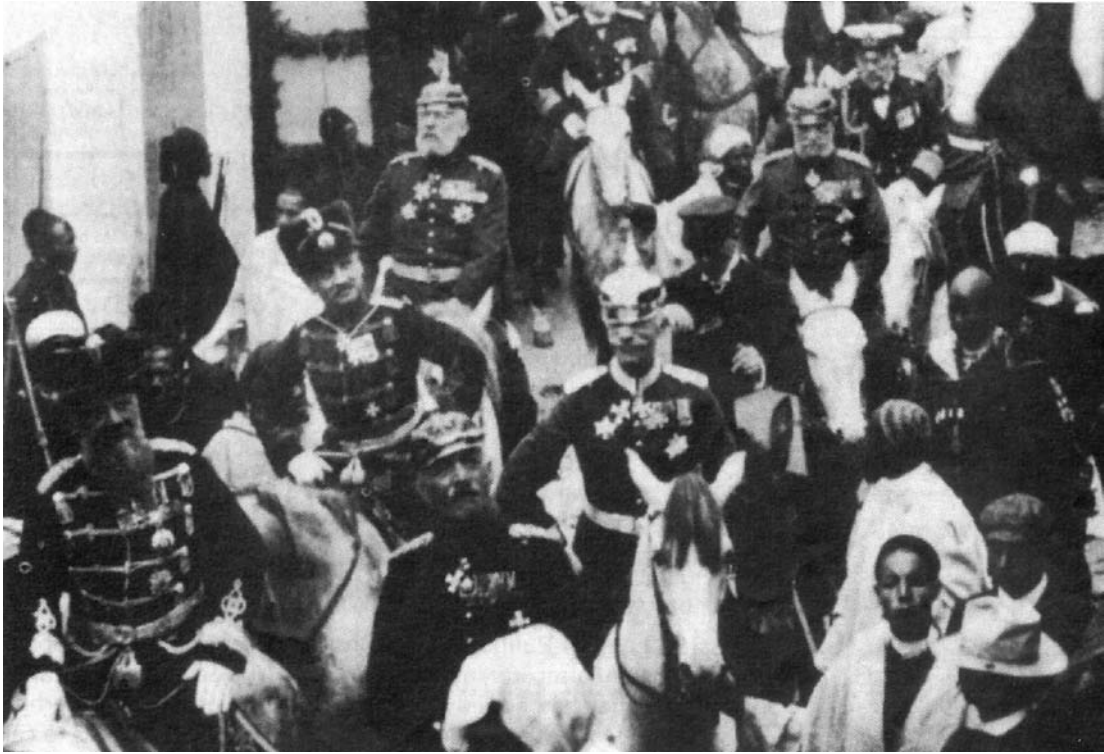
Kaiser Wilhelm II riding through Tangier in 1905.