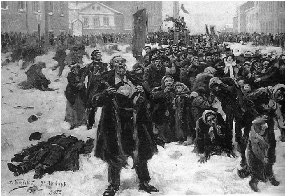
A painting of Bloody Sunday, produced around 1910.

11 Study the painting, and then answer the questions which follow.