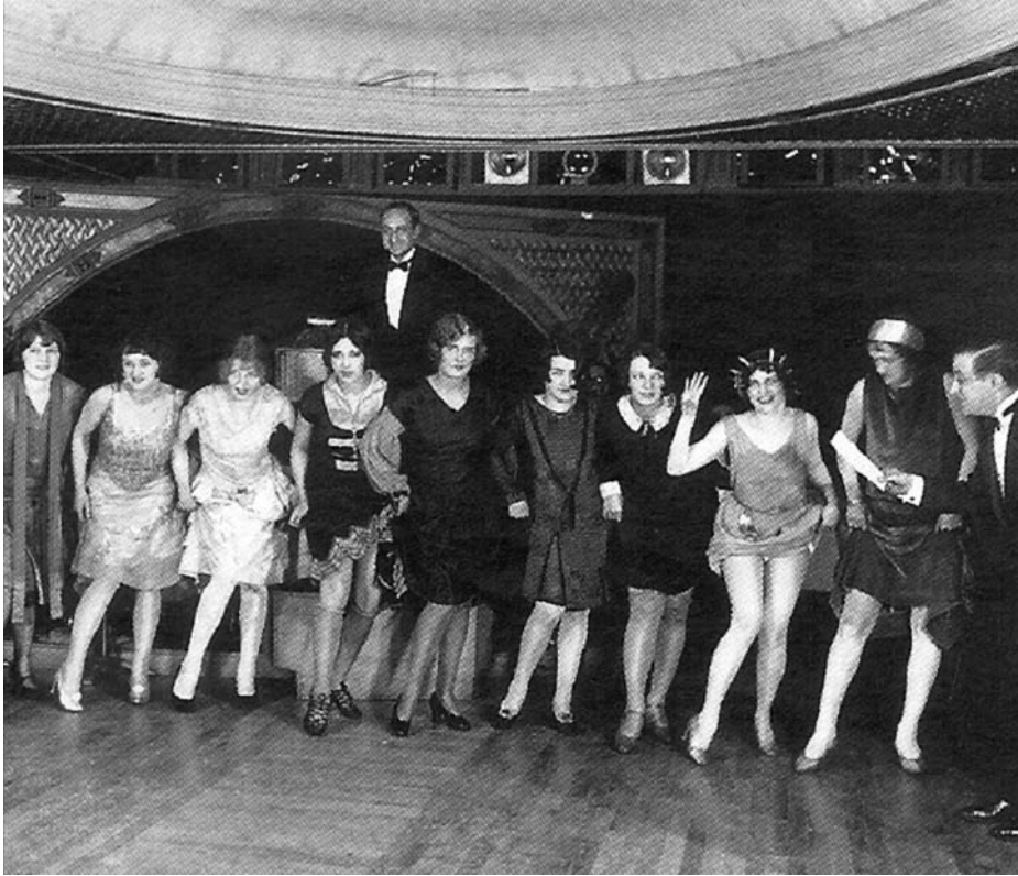
Flappers in the 1920s.

13 Study the photograph, and then answer the questions which follow.