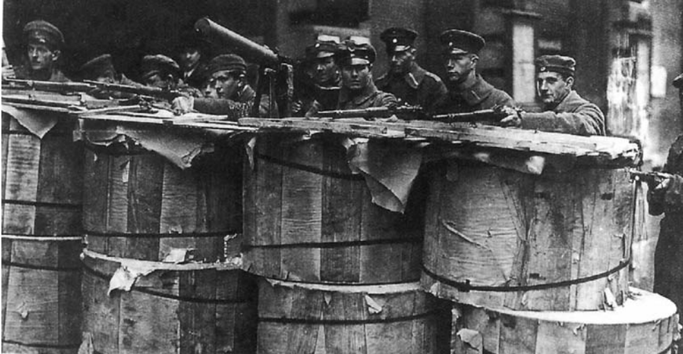
Spartacists defending the captured newspaper offices, 1919.