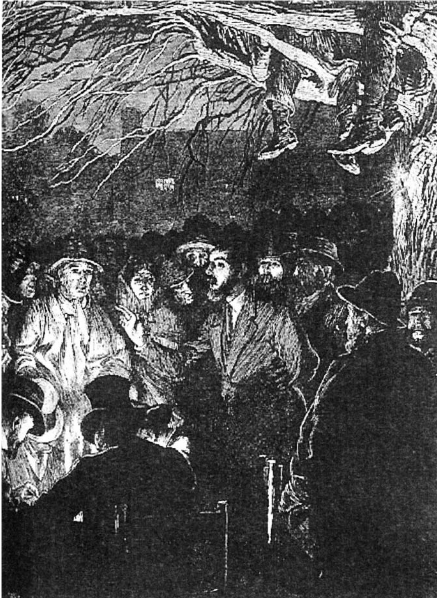
Joseph Arch speaking to members of the National Agricultural Labourers' Union in the 1870s. The meeting was held at night for fear of victimisation by landowners.

23 Study the illustration, and then answer the questions which follow.